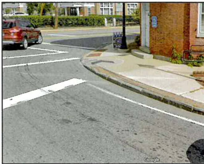
Main Street and Newmarket Road – Phase I and II Sidewalk Reconstruction

Continental Paving has provided a unit price proposal to complete this work inclusive of traffic control, installation of 4" of 5-foot-wide concrete walks with reinforcing mesh, ADA ramps with detectable warning plates, crushed stone and curbing for a total of $106,791, included within the proposed contract total above.