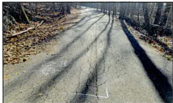
Timber Lane Road - Severe Alligator Cracking and Minor Rutting Near Boring No. B16

Back River Road, from the intersection of Route 4 to the Madbury town line, is a roadway which will receive a Mill and Overlay treatment. The process of milling and installing a pavement wearing course also known as a "mill and fill" includes the removal of the existing surface layer or wearing course of a pavement cross section with a milling machine and the replacement of the milled location with approximately 1.5" of new asphalt. This targeted maintenance approach will extend the overall longevity of the roadway until such time the entire roadway becomes a candidate for reclamation and paving. Also included in the 2022 Road Program is a targeted mill and pave