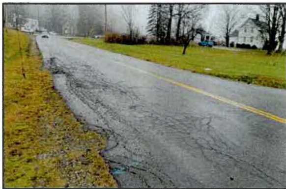
Mast Road - Very Severe Alligator Cracking Raveling and Shoulder Loss

with the presence of clayey silt subgrade and seasonal weakening of that subgrade. It was evident from the investigation that the existing asphalt pavements in the test areas are exhibiting symptoms of minor to very-severe distresses resulting from a combination of thermal and age-related shrinkage and subgrade fatigue. The recommended treatment for each of these roads is a reclaim and pave. Reclamation is the process of pulverizing and blending layers of asphalt and existing road base material in place on the roadway in order to provide an adequate base and consistent material upon which to place and support a new surface of asphalt.