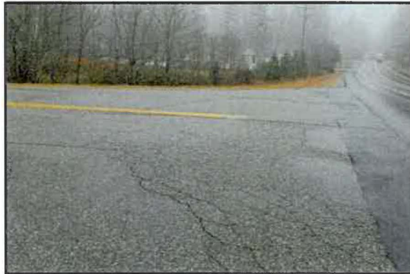
Pendexter Road at Madbury Road - Localized Rutting and Alligator Cracking