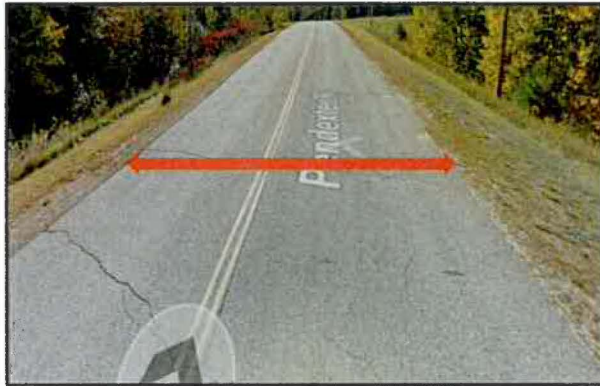
Pendexter Road – Construct 28' Wide Consistent Width Roadway – 11-foot travel lanes with 3-foot Paved Shoulders