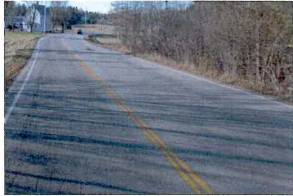
Back River Road - Alligator Cracking and Longitudinal Cracking