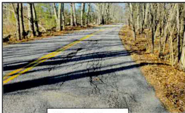
Wednesday Hill Road – Very Severe Cracking and Rutting Near Boring No. B13