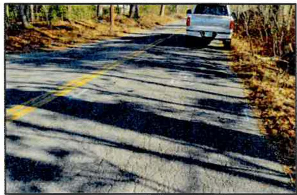
Mast Road - Very Severe Alligator Cracking and Rutting, indicating Base Failure

In addition, due to the extremely poor-quality of the base materials encountered in certain areas on Pendexter Road and Mast Road which is evident by pavement failures, Durham Public Works intends on using public works forces to improve the existing gravels in targeted areas by excavating unsuitable base materials and replacing with specified roadway gravels. Furthermore, adjustments in pavement width of a section of Pendexter Road, from the intersection of Madbury Road, extending easterly approximately 550 feet, are planned in an effort to develop a uniform roadway width, enhance traffic calming by narrowing the roadway and to improve stormwater quality by reducing impervious areas. The current width of 33+ feet is inconsistent with the recommended pavement width, based on traffic volumes, and will be reduced to 28 feet ( 11-foot travel lanes ) with 3-foot paved shoulders.