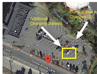
Site A Pettee Brook Lot Expansion