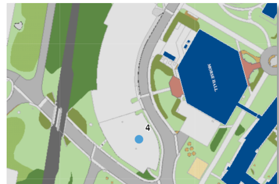
Site 4 College Road Visitor Lot