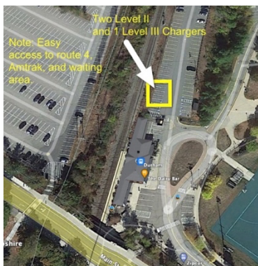
Site 5 Depot Lot @ train station