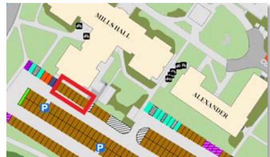
Site 2 Campus Crossing Visitor Lot