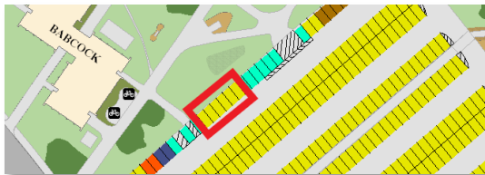
Site 3 Lot B