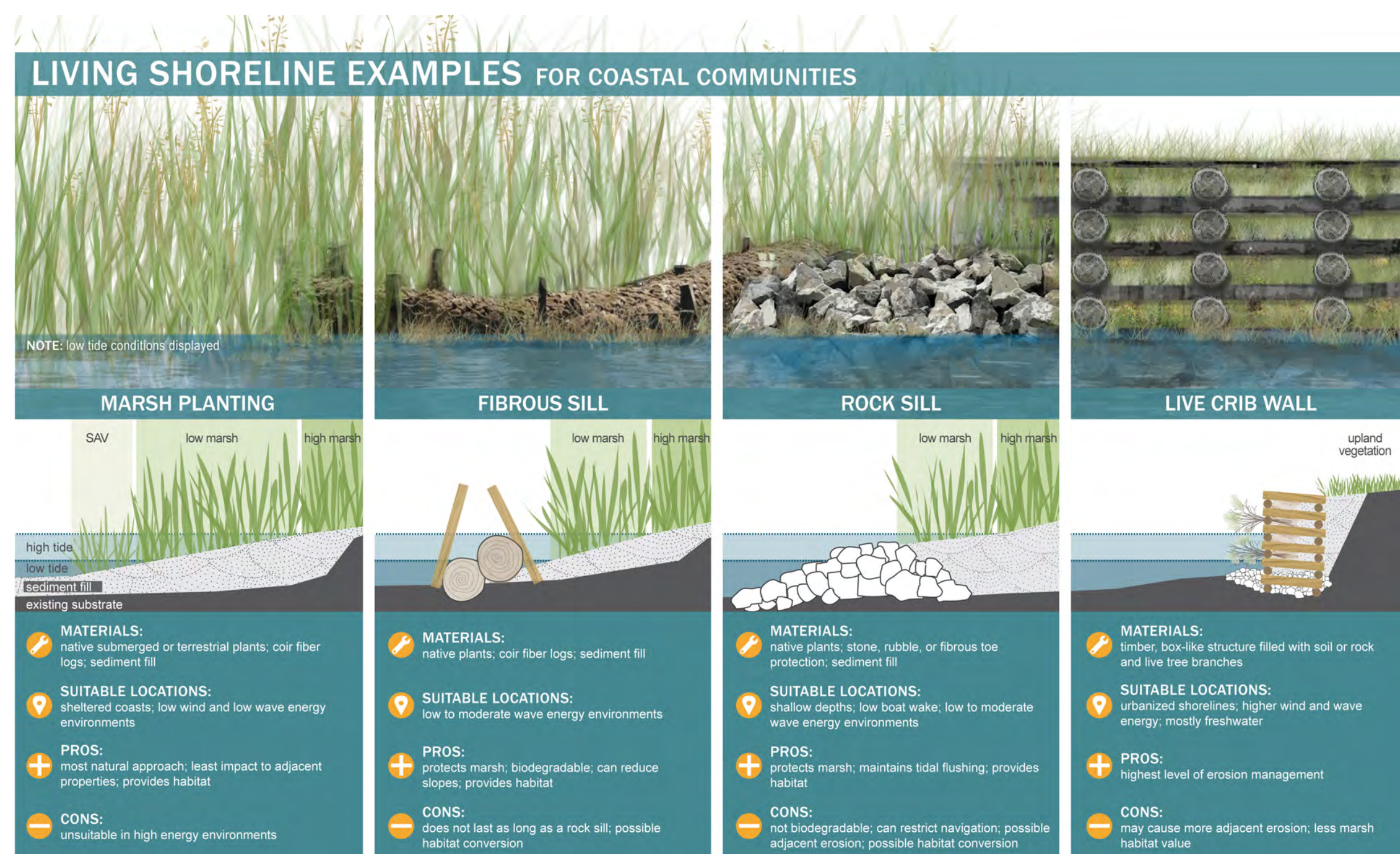
Illustration by Liz Podowski King. Original content developed by Carolyn LaBarbiera and Liz Podowski King with support from the New York Department of State. Adapted for use by the NHDPS Coastal Program