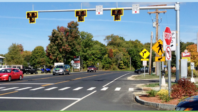
NH 125, Epping

New Hampshire law says bicyclists have the same rights and duties as drivers of motor vehicles. (RSA 265:143) Motorists must yield to bicyclists when turning, merging into bicycle lanes, and opening doors. (RSA 265:96)