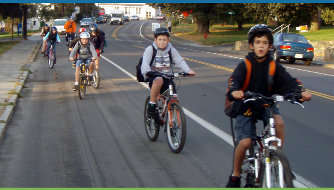
NH 116, Littleton

Bicyclists have the same rights and duties as drivers of motor vehicles. (RSA 265:143) Bicyclists must stop at stop signs and red lights, yield to pedestrians, and ride with traffic.