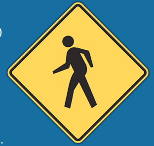
NH 28A, Manchester