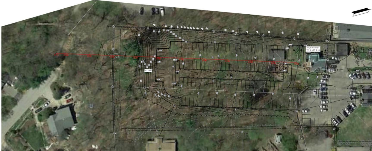
Profile View of Overall site to Chesley Dr