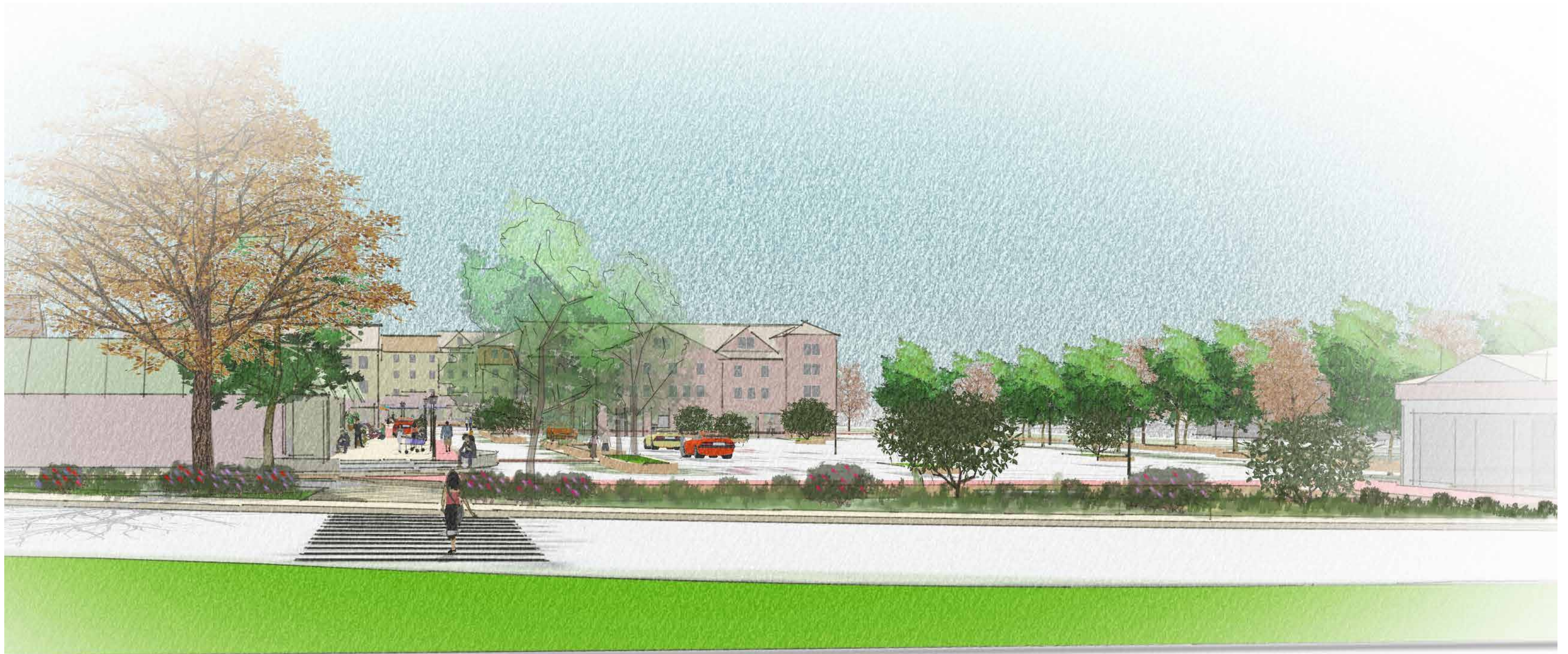
View from the sidewalk near the UNH Campus, looking east, with Hannaford on the left and new buildings in the background. A small stop or cafe at the right side of the view from the sidewalk-edge landscape and plaza.