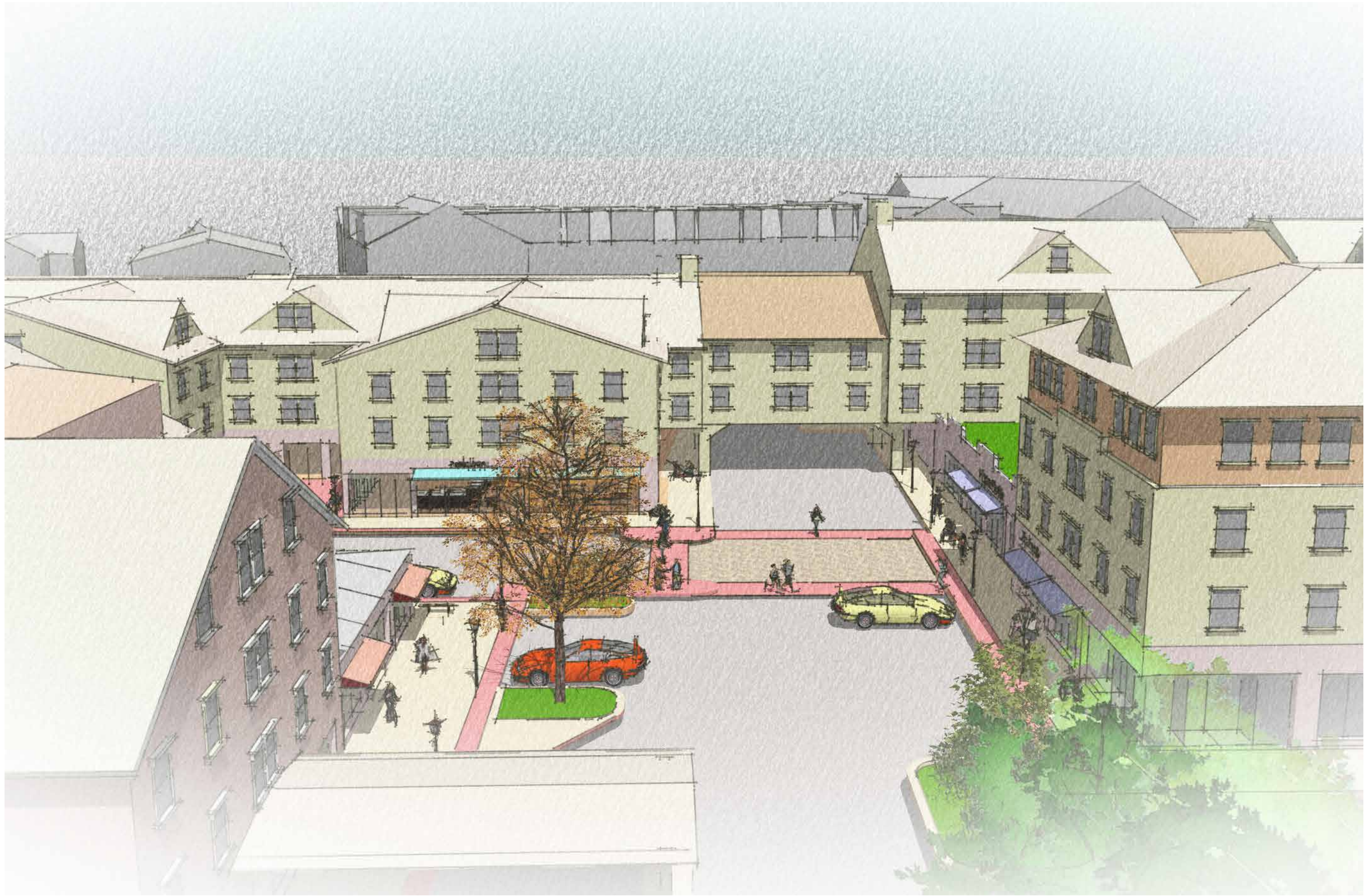
View towards the new square includes looking north, with the Orion Projects rooftops in the background and the terraced mixed-use buildings on the right.