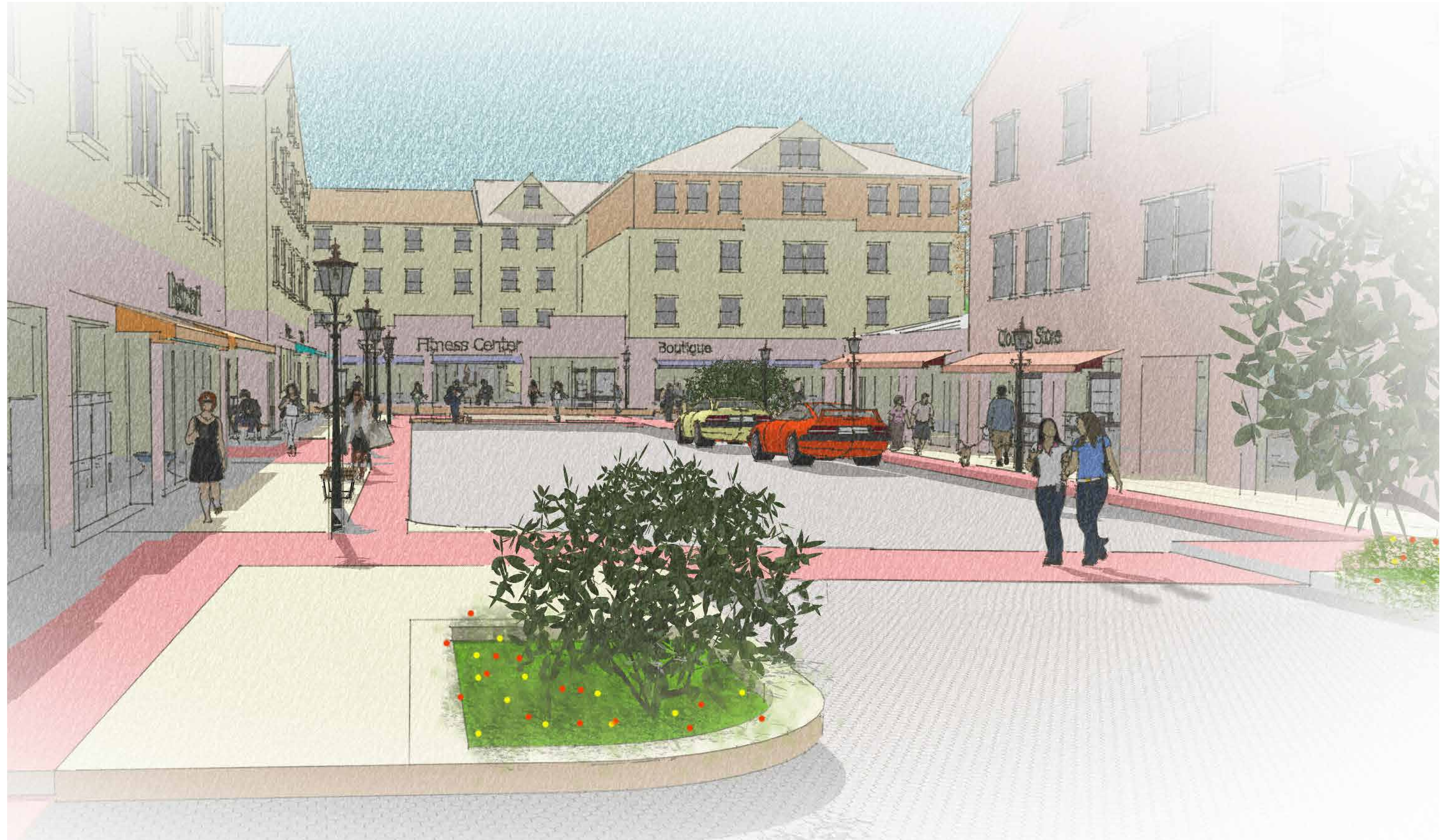
View along the new “street” that will be created. This view focuses on the terraced, mixed-use buildings that will frame a new square at the end of the street.