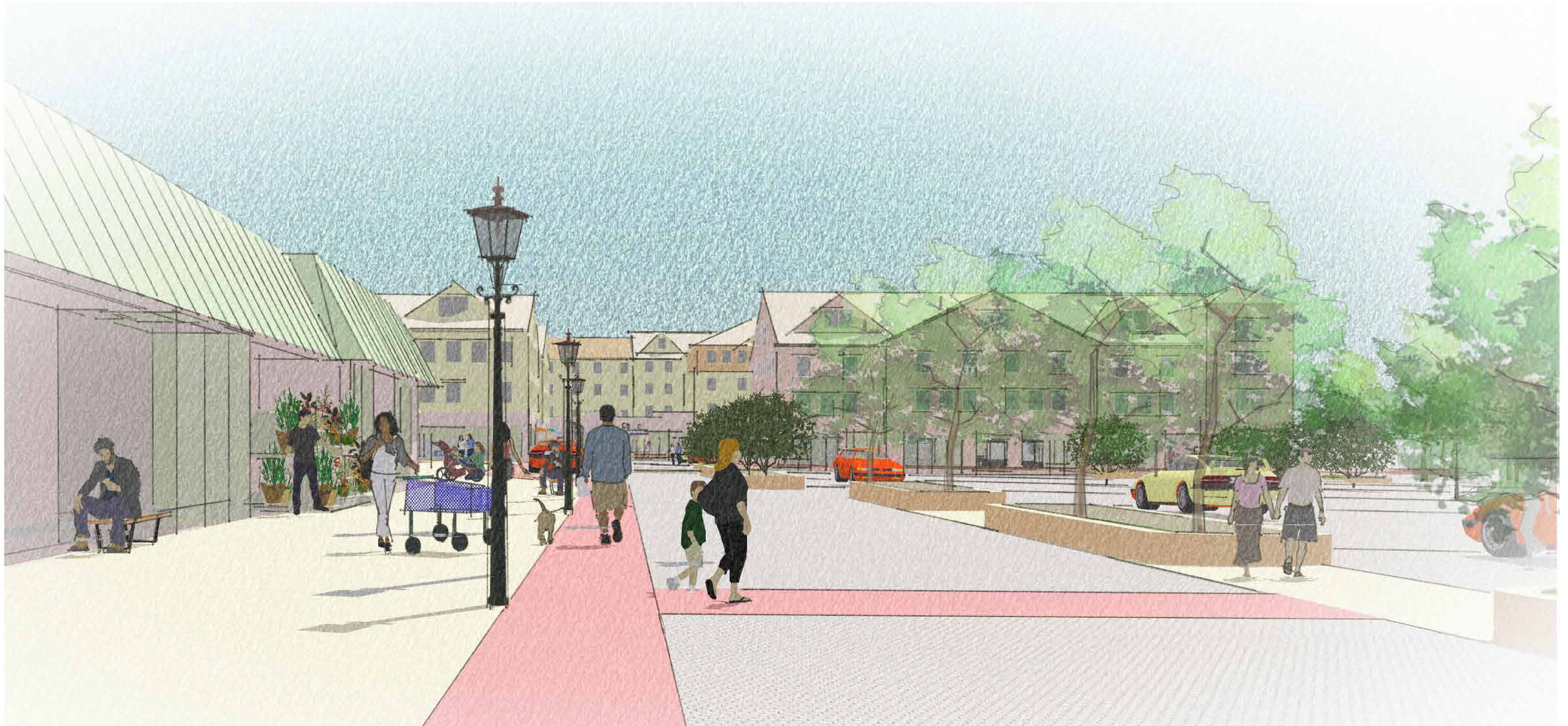
View from in front of Hannaford's toward the new mixed-use buildings. Note that a new and taller facade will be created for the existing retail building to make it more attractive and supportive of the pedestrian environment.