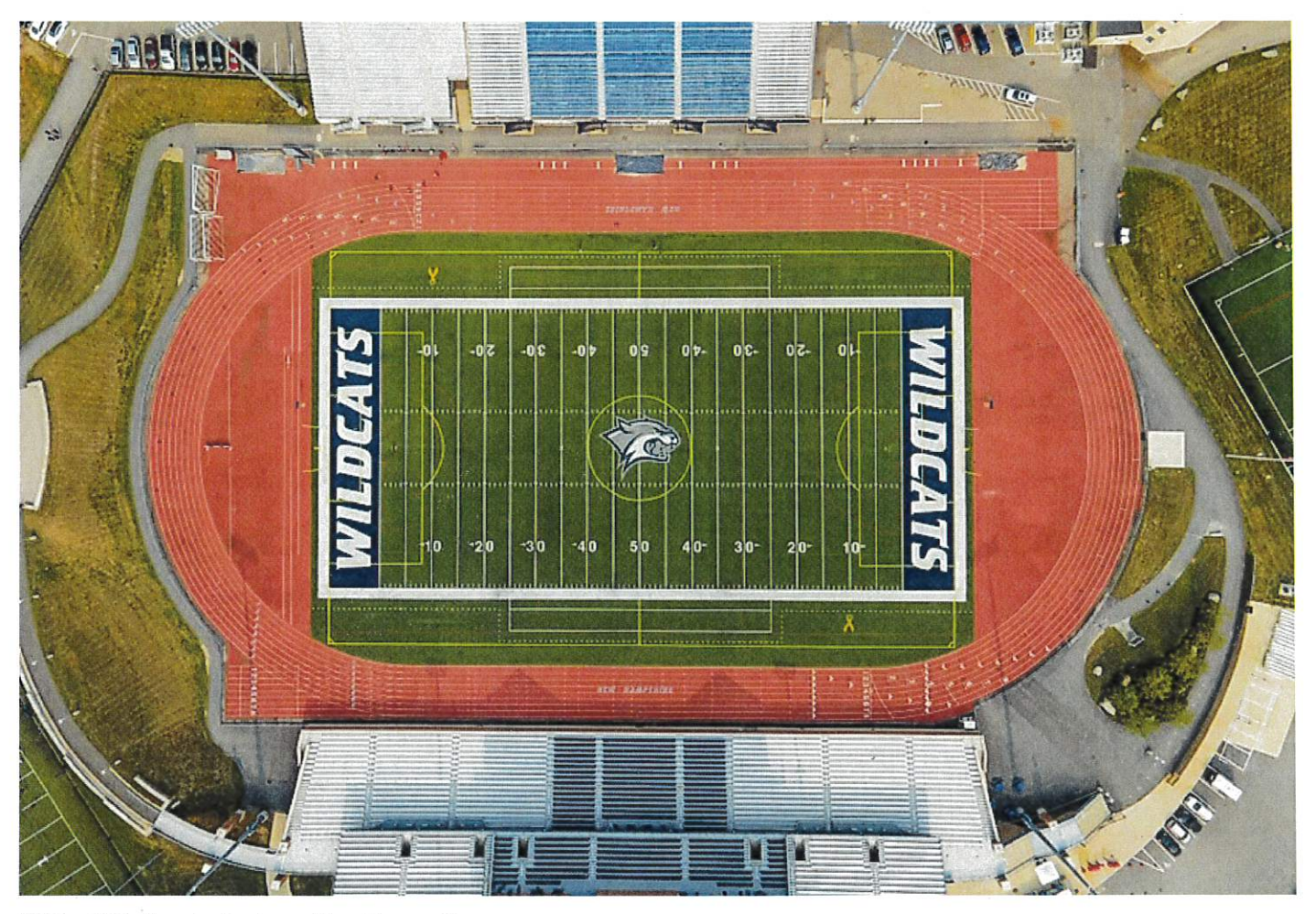
Wildcat Stadium in Durham, New Hampshire.

One of the most significant reasons behind Durham's rapid growth is its expanding economic landscape. While the university remains a cornerstone of employment and activity, Durham has also emerged as a destination for technology firms, sustainable enterprises, and remote workers. Thanks to research facilities like the UNH InterOperability Laboratory, which has earned international recognition in network testing and development, Durham attracts businesses in computer science, clean energy , and biotechnology.