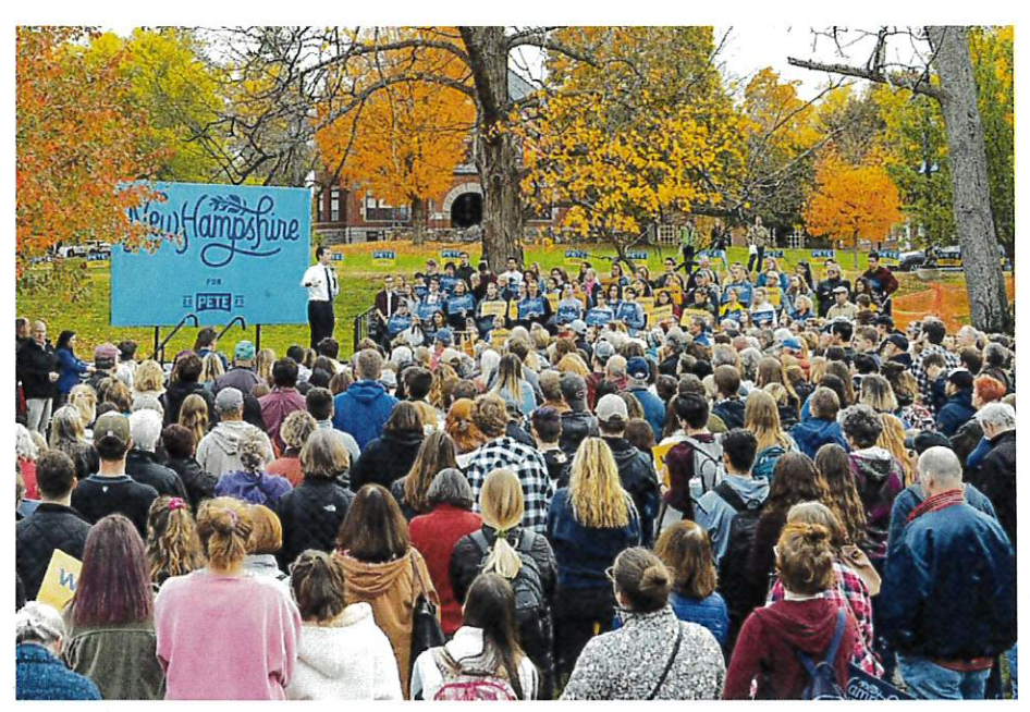
A town hall meeting in Durham, New Hampshire.

At its core, Durham is a place where people care. The community is known for being progressive, inclusive, and highly involved in local decision-making. Civic engagement is strong, with residents participating in town meetings, school board discussions, and sustainability initiatives. Newcomers consistently find Durham to be a welcoming place where they can easily get involved, meet neighbors, and become part of the fabric of the city. Whether raising a family, launching a business, or settling into retirement, Durham supports an engaged, thoughtful way of life.