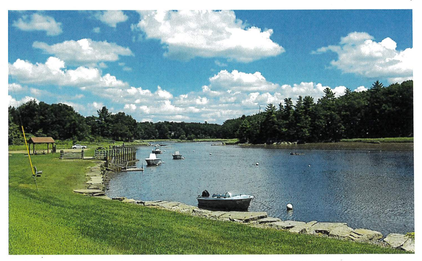
Scenic nature along the banks of Oyster River in Durham, New Hampshire.

Durham's natural beauty is among its most compelling features. The city is perfectly positioned between New Hampshire's famous lakes region and its picturesque seacoast, making it a haven for outdoor enthusiasts. The nearby Great Bay Estuary offers breathtaking views and biodiversity, ideal for birdwatching, kayaking, or simply soaking in the serene landscapes.