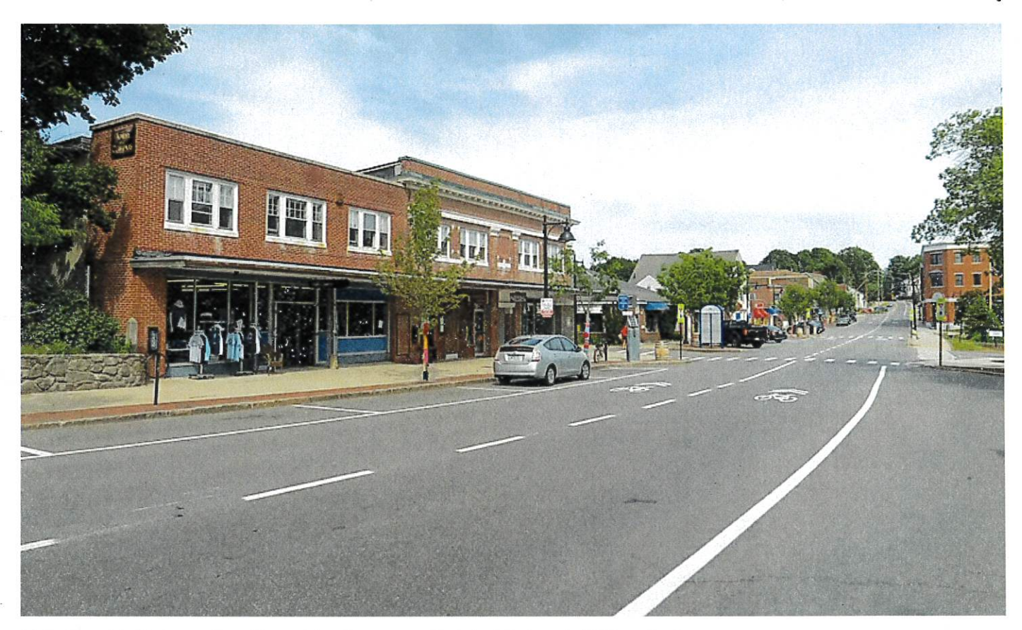
Main Street in Durham, New Hampshire.

While it may be best known for academics and nature, Durham also boasts a lively cultural and tourism scene that's grown significantly over the past decade. Much of this vibrancy comes from the University of New Hampshire, which hosts a variety of artistic and athletic events throughout the year. The Paul Creative Arts Center presents plays, musical performances, and public lectures, while the Whittemore Center Arena regularly fills with fans for hockey games, concerts, and major gatherings.