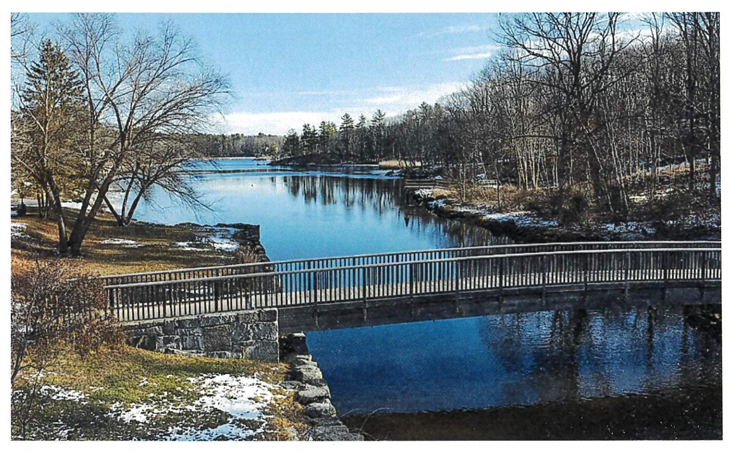
A bridge across the Oyster River in Durham, New Hampshire.

Just a short drive from downtown, residents can easily reach the Atlantic Ocean , with sandy beaches in Rye and Hampton providing ideal weekend escapes. Proximity to the White Mountains and Lake Winnipesaukee further extends the range of recreational possibilities. Whether hiking, skiing, boating, or camping, Durham places all of New Hampshire's outdoor attractions within easy reach.