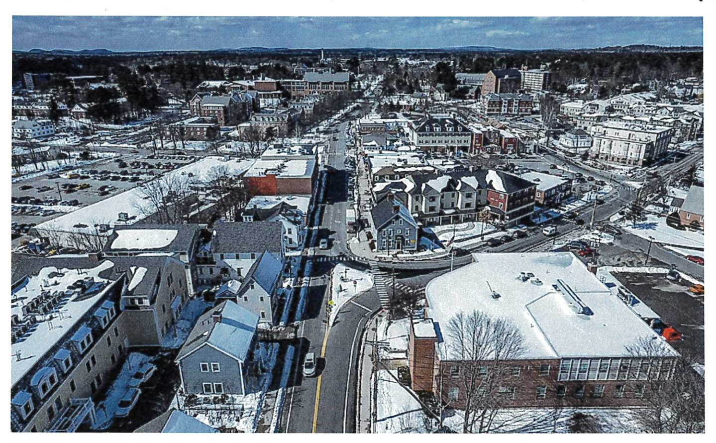
Aerial view of Durham, New Hampshire, in winter.

Throughout the year, events such as Durham Day, holiday parades, and university festivals provide entertainment and bring the community together. These cultural offerings, combined with its natural beauty and welcoming spirit, make Durham an increasingly popular destination for tourists and day-trippers exploring New Hampshire.