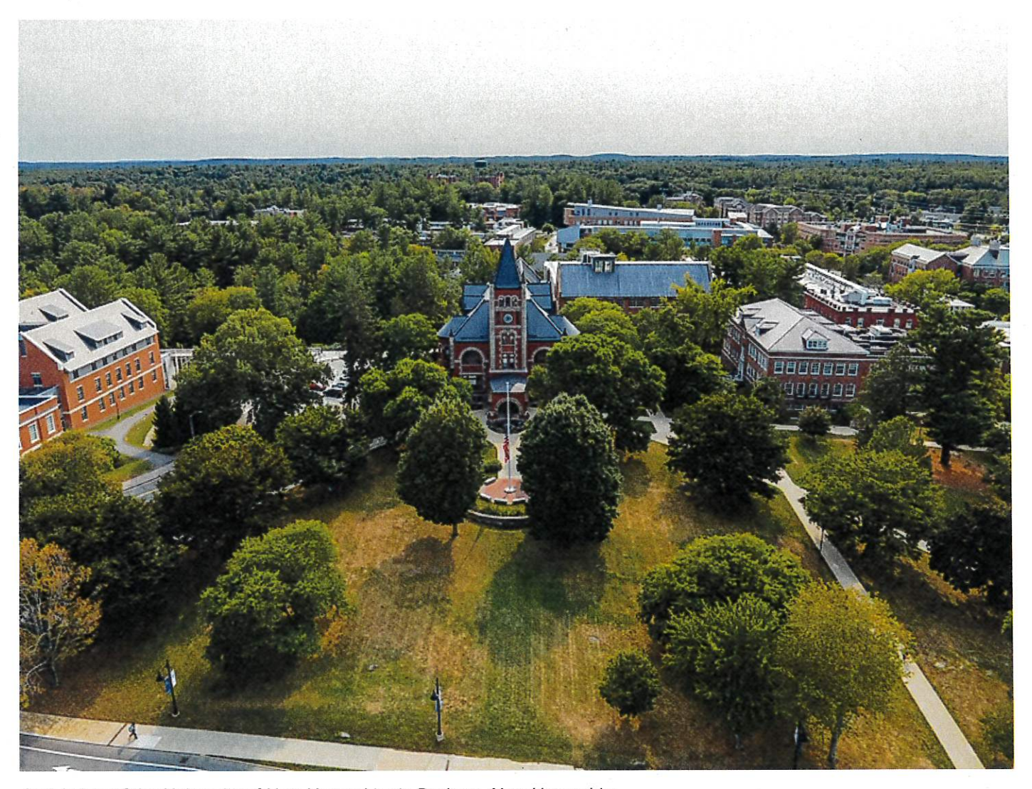
Aerial view of the University of New Hampshire in Durham, New Hampshire.

Durham's story begins centuries ago, with its earliest colonial settlements tracing back to the 1600s. Incorporated in 1732, the town has always maintained a strong connection to its heritage, visible in its preserved architecture, historic homes, and charming downtown layout. While the town honors its roots, Durham also represents a community that is forward-thinking and open to growth. At the heart of this evolution is the University of New Hampshire , an institution that not only anchors the city academically and culturally but also serves as a major driver of its economy and development.