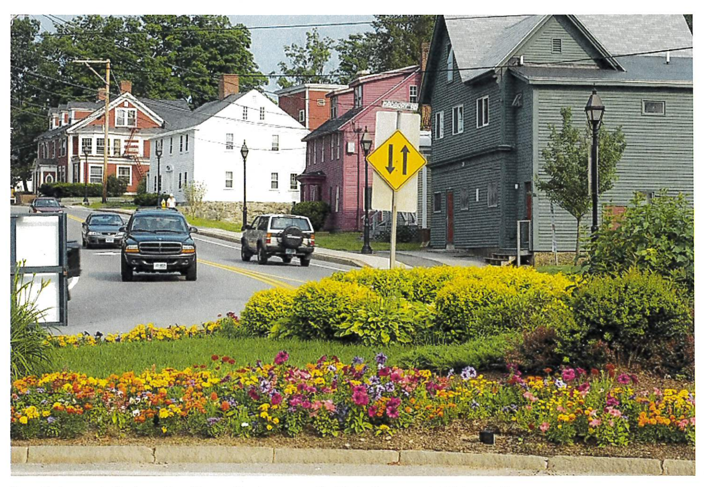
Beautifu homes in Durham, New Hampshire.

As housing costs surge in nearby cities such as Portsmouth and Boston , Durham has become a standout choice for those seeking a more affordable yet high-quality lifestyle. The city offers a well-rounded selection of housing, including newer developments, renovated colonial homes, and charming neighborhoods that provide walkability and a strong sense of community.