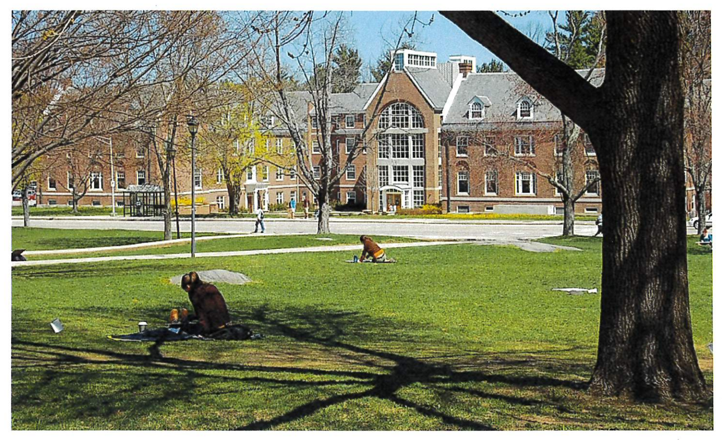
Congreve Hall on the University of New Hampshire campus in Durham, New Hampshire.

The University of New Hampshire, founded in 1866, has grown into the state's flagship public research institution. Its influence reaches far beyond the student population. It supports local businesses, fosters innovation, and brings in talent from around the globe . The partnership between Durham and the university continues to evolve, creating a relationship where education, research, and community development are deeply intertwined.