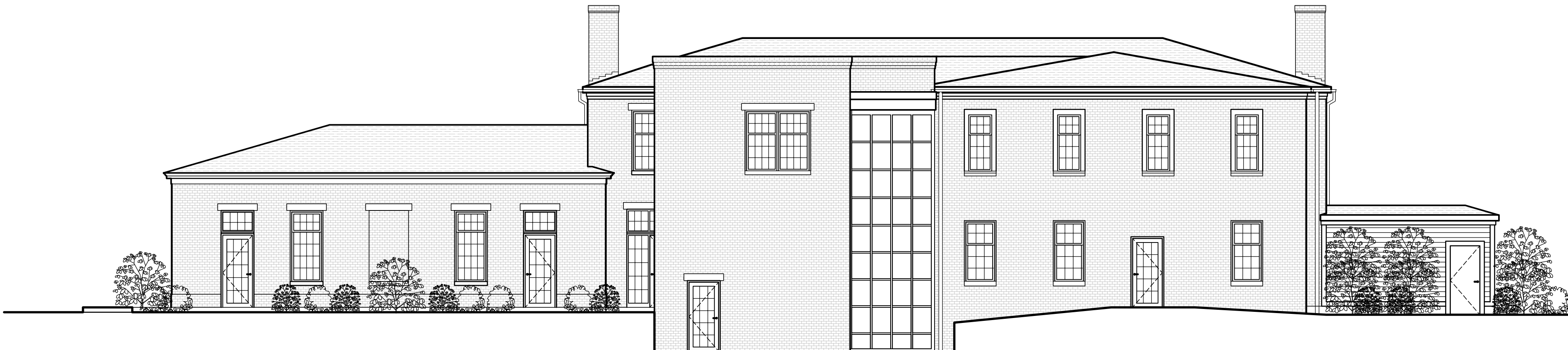
④ West Elevation