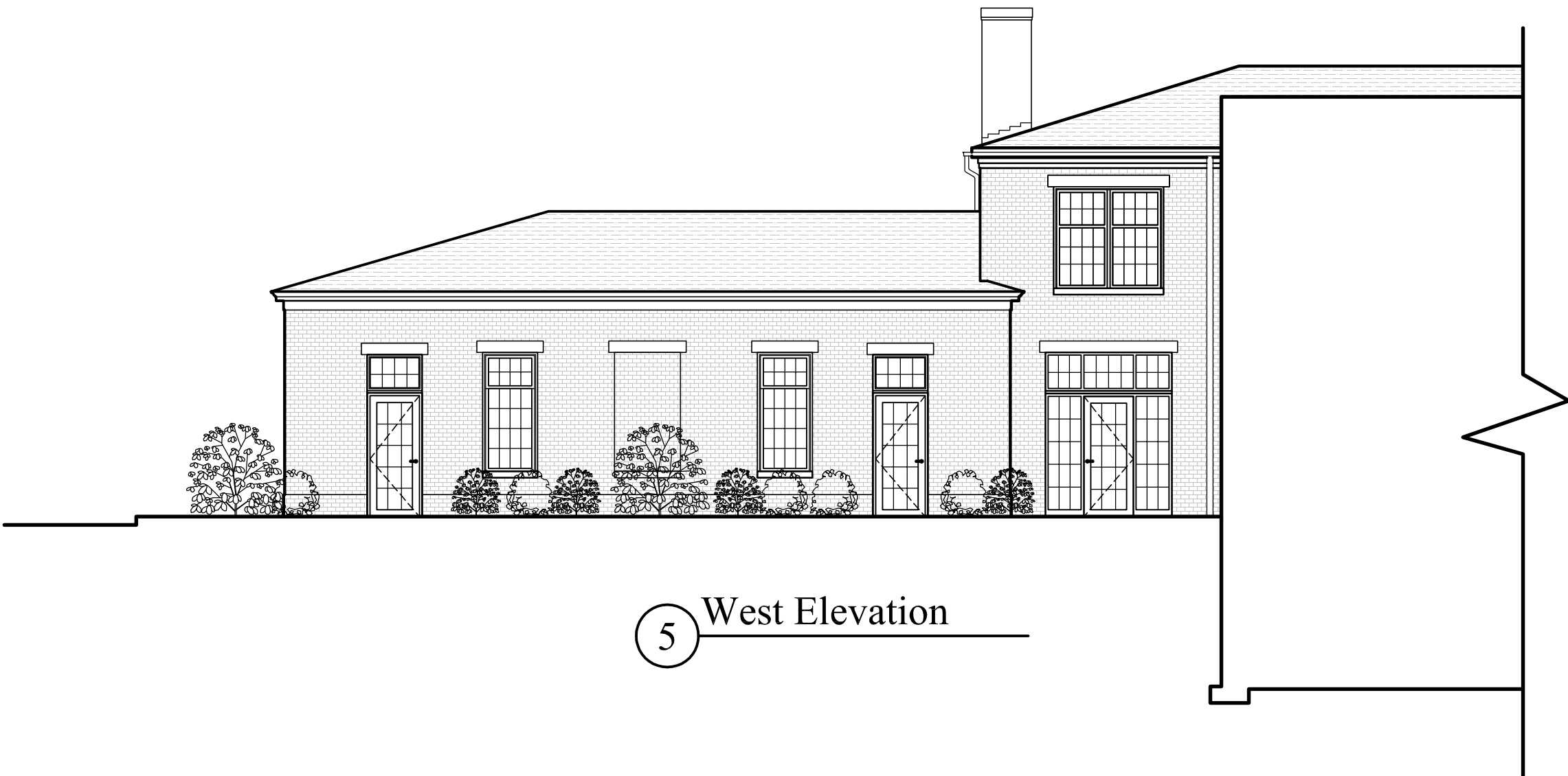
⑤ West Elevation