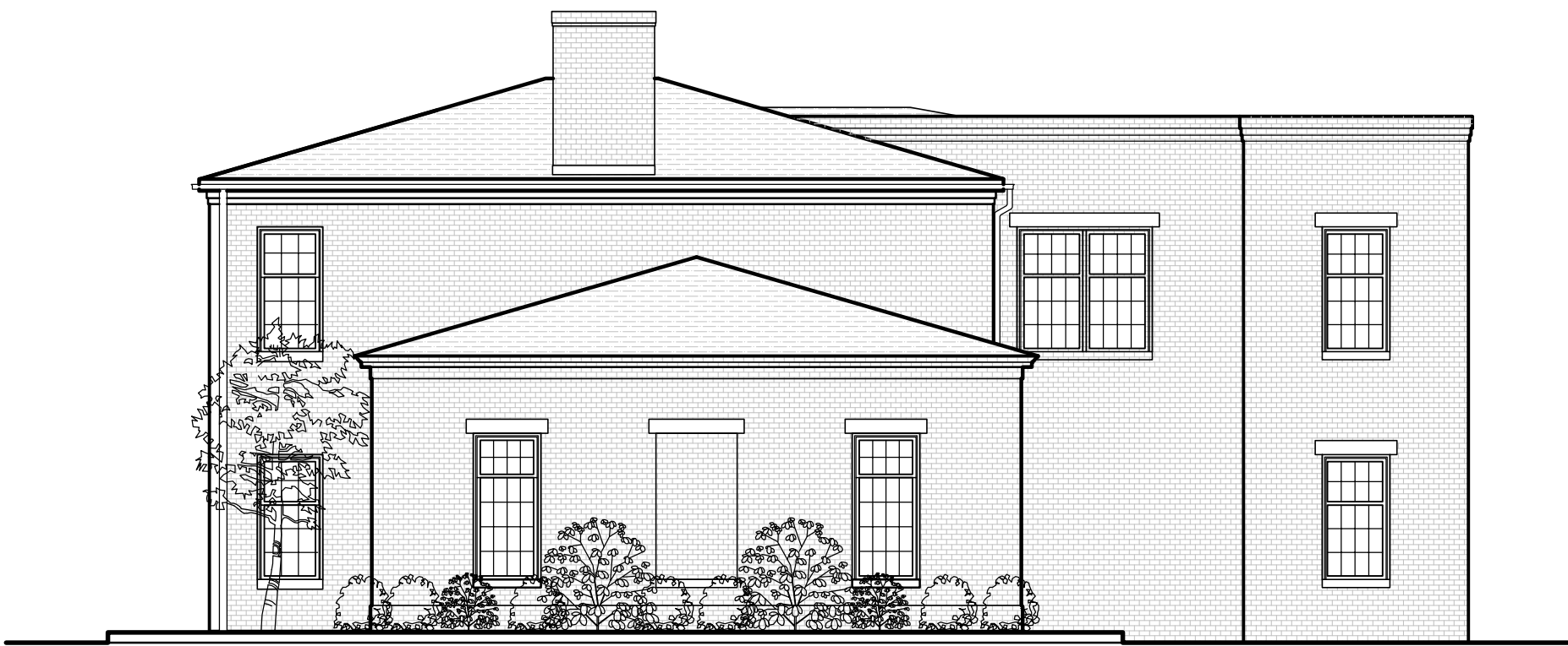
① North Elevation