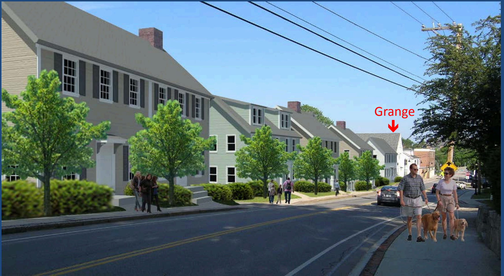
Pedestrian friendly streetscape