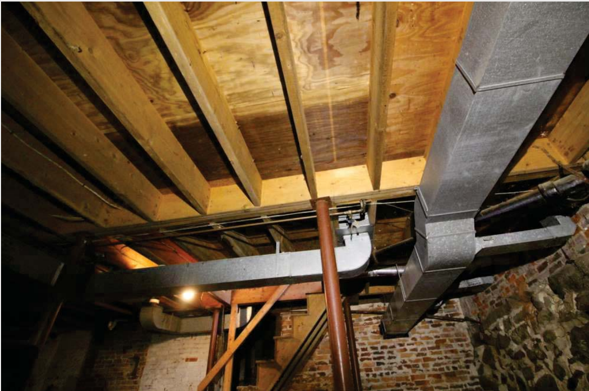
19 156 Piscataqua Rd | Durham, New Hampshire Oct 28, 2019 | 12:23 PM Jessica MilNeil

The framing beneath the southwest kitchen has been replaced fully, with conventional 2x10s. The joists were toe-nailed into the girders and should be reinforced with joist hangers.