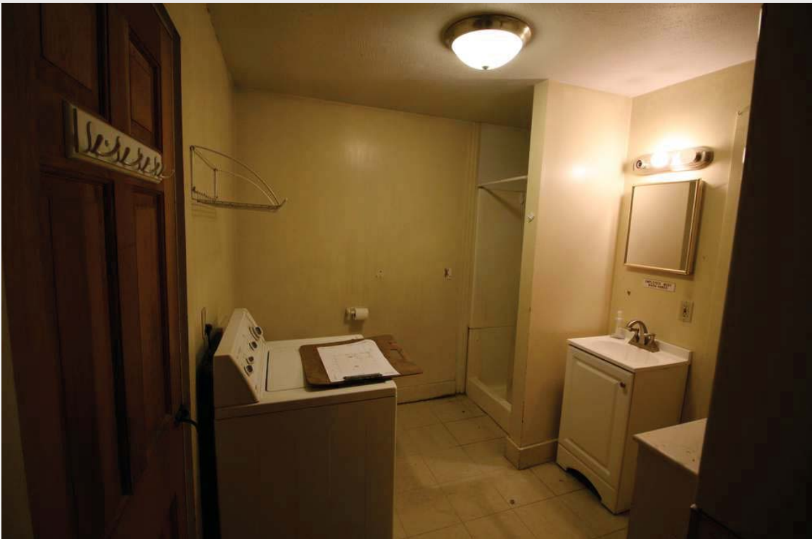
28 156 Piscataqua Rd | Durham, New Hampshire Oct 31, 2019 | 9:33 AM Jessica MilNeil

The east entrance is an unusual element of its layout.