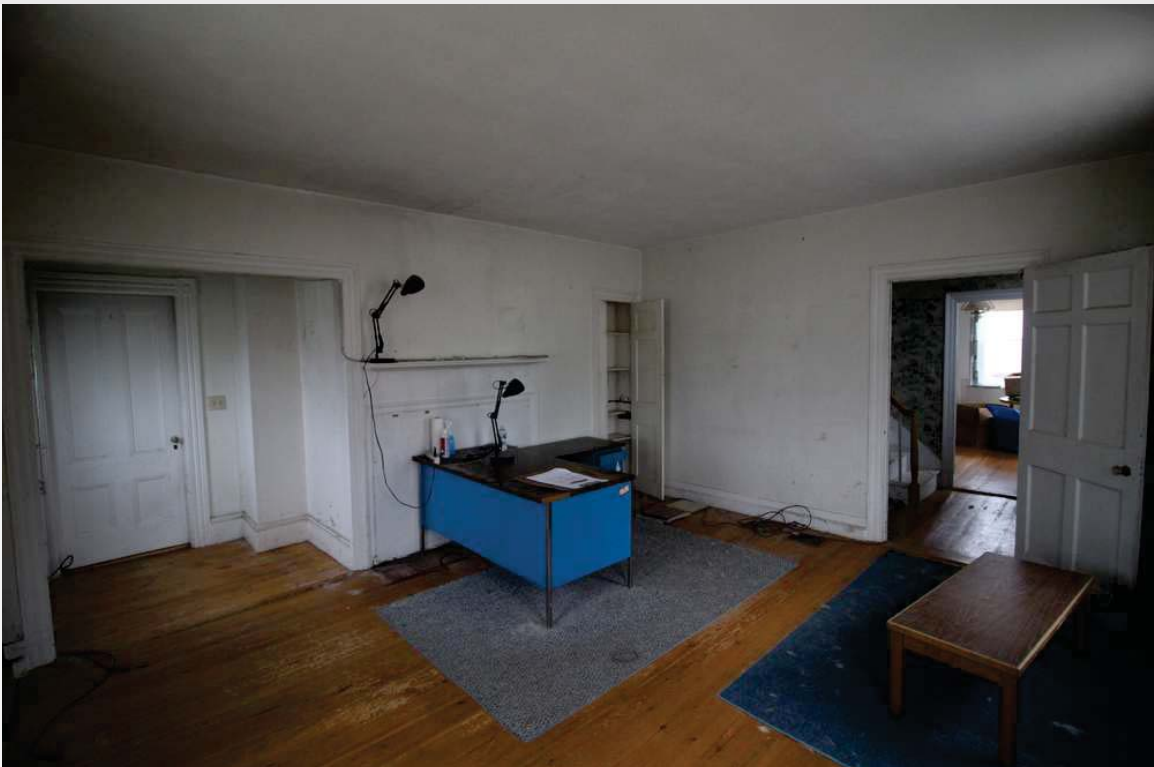
Front entrance, from the stair landing.