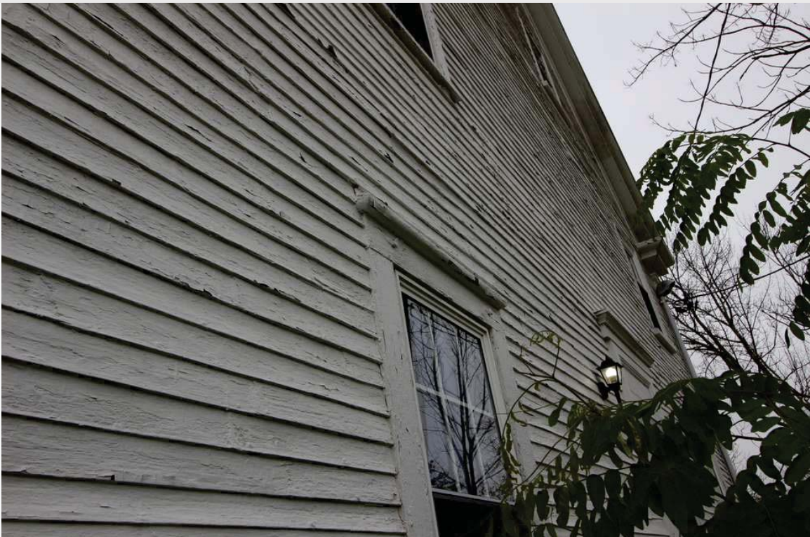
62 156 Piscataqua Rd | Durham, New Hampshire Oct 28, 2019 | 9:04 AM Jessica MilNeil

This relatively flat, elliptical cornice is characteristic of the Greek Revival period. The window molding, with mitered backband, reflects Federal era influences. Both styles existed concurrently, to a degree, especially in a rural setting.