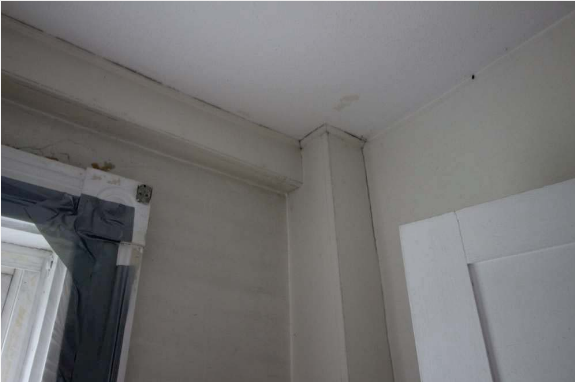
41 156 Piscataqua Rd | Durham, New Hampshire Oct 31, 2019 | 2:11 PM Jessica MilNeil

In the southeast storage room, both this interior post and the south plate are visible.