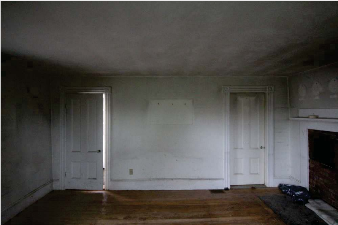
32 156 Piscataqua Rd | Durham, New Hampshire Oct 31, 2019 | 9:31 AM Jessica MilNeil

Northwest fireplace surround is very close to a couple examples found in Asher Benjamin's building guides.