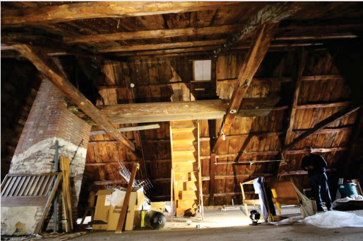
54 | 156 Piscataqua Rd | Durham, New Hampshire | Oct 28, 2019 | 2:04 PM

The current roof is called a principal rafter-common purlin roof. The rafters are large timbers, tapering from heel to apex of roof. Each pair is connected by a collar tie at the mid-span and bridle joint at the ridge.