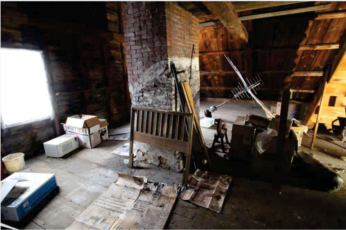
52 156 Piscataqua Rd | Durham, New Hampshire Oct 28, 2019 | 2:06 PM

West chimney, attic. Shadow-lines on both chimneys are consistent with a hip roof.