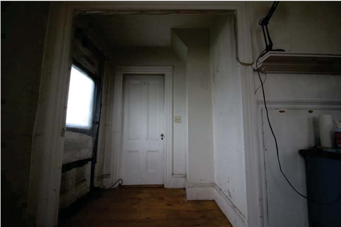
27 156 Piscataqua Rd | Durham, New Hampshire Oct 31, 2019 | 11:01 AM Jessica MilNeil

The east entrance is an unusual element of its layout.