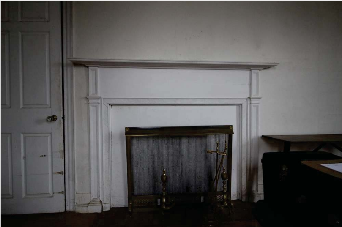
31 156 Piscataqua Rd | Durham, New Hampshire Oct 31, 2019 | 10:32 AM Jessica MilNeil

Northwest fireplace surround is very close to a couple examples found in Asher Benjamin's building guides.