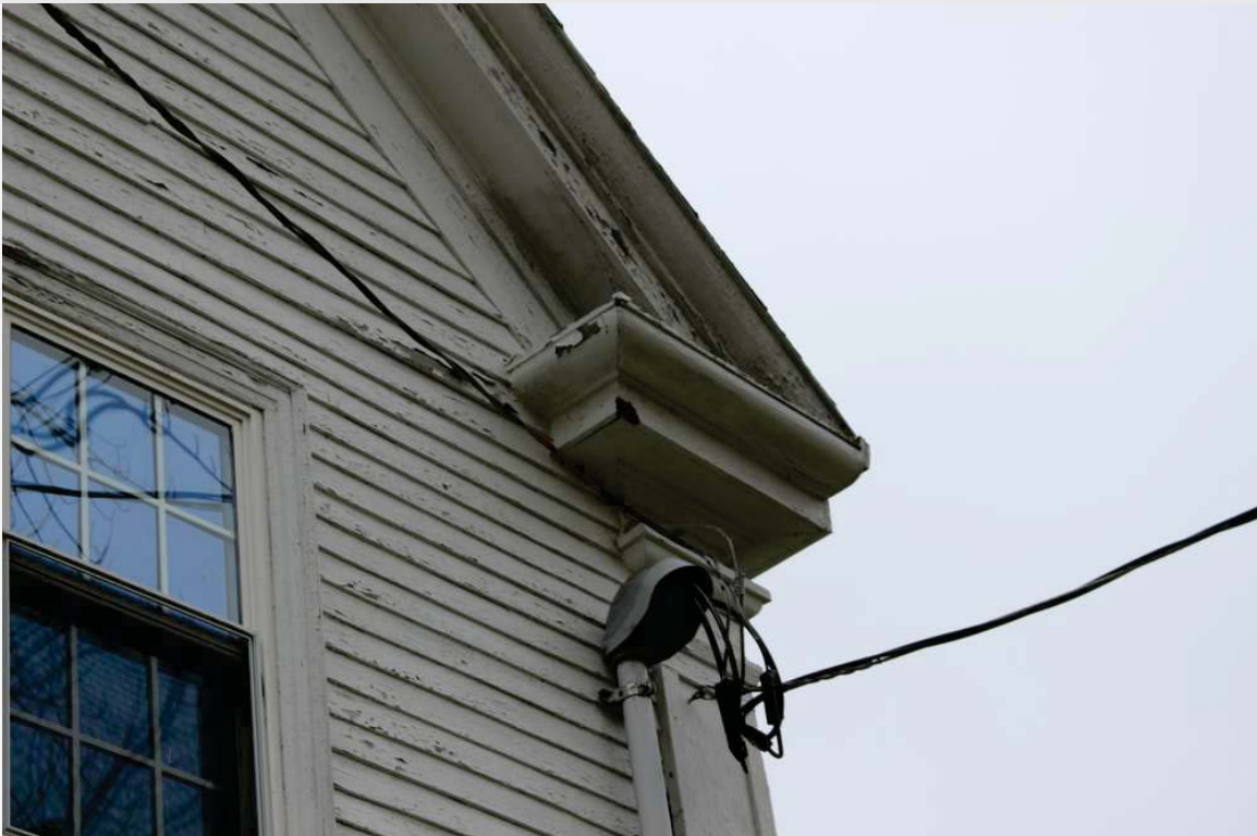
61 156 Piscataqua Rd | Durham, New Hampshire Oct 28, 2019 | 2:13 PM Jessica MilNeil

This relatively flat, elliptical cornice is characteristic of the Greek Revival period. The window molding, with mitered backband, reflects Federal era influences. Both styles existed concurrently, to a degree, especially in a rural setting.