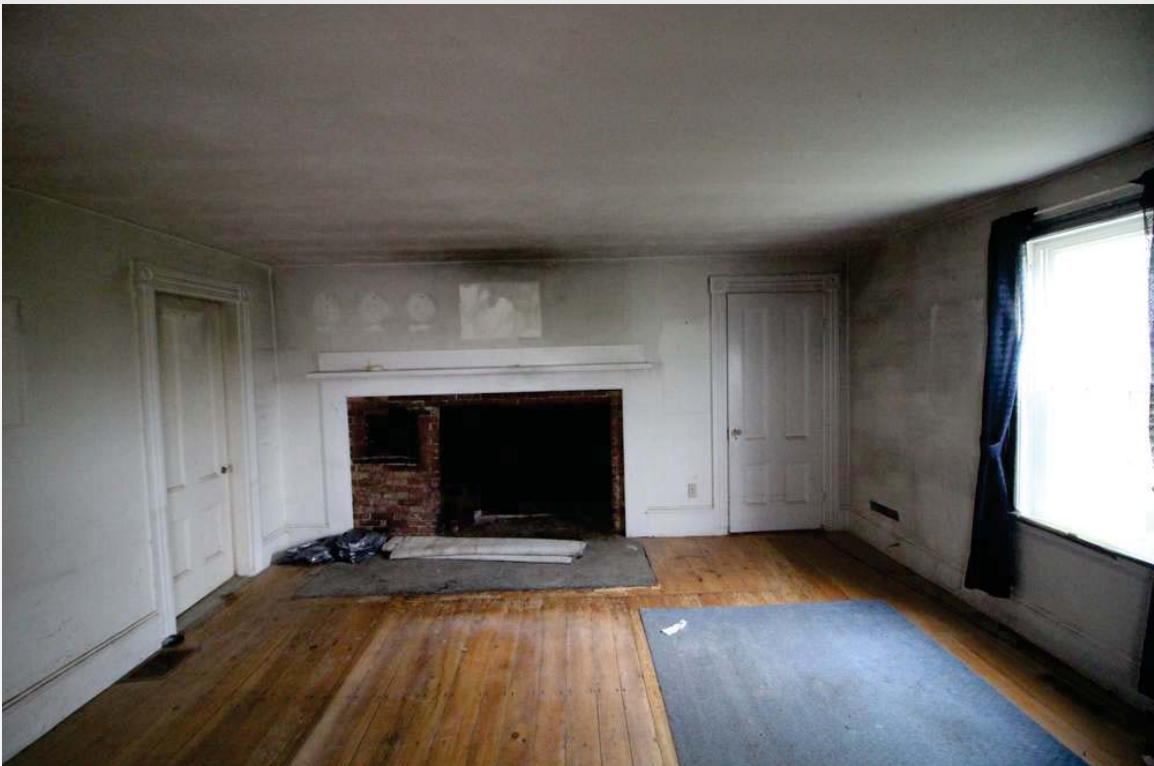
20 156 Piscataqua Rd | Durham, New Hampshire Oct 31, 2019 | 9:30 AM Jessica MilNeil

The framing beneath the southwest kitchen has been replaced fully, with conventional 2x10s. The joists were toe-nailed into the girders and should be reinforced with joist hangers.