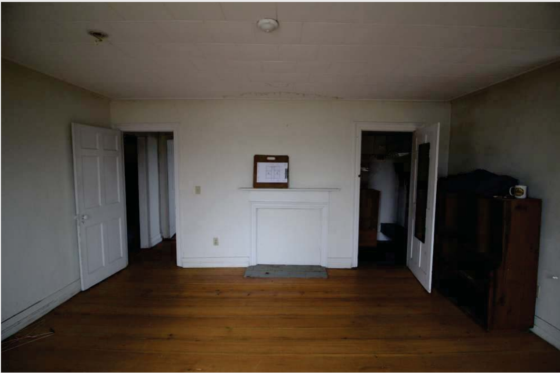
42 156 Piscataqua Rd | Durham, New Hampshire Oct 31, 2019 | 12:37 PM Jessica MilNeil

In the southeast storage room, both this interior post and the south plate are visible.