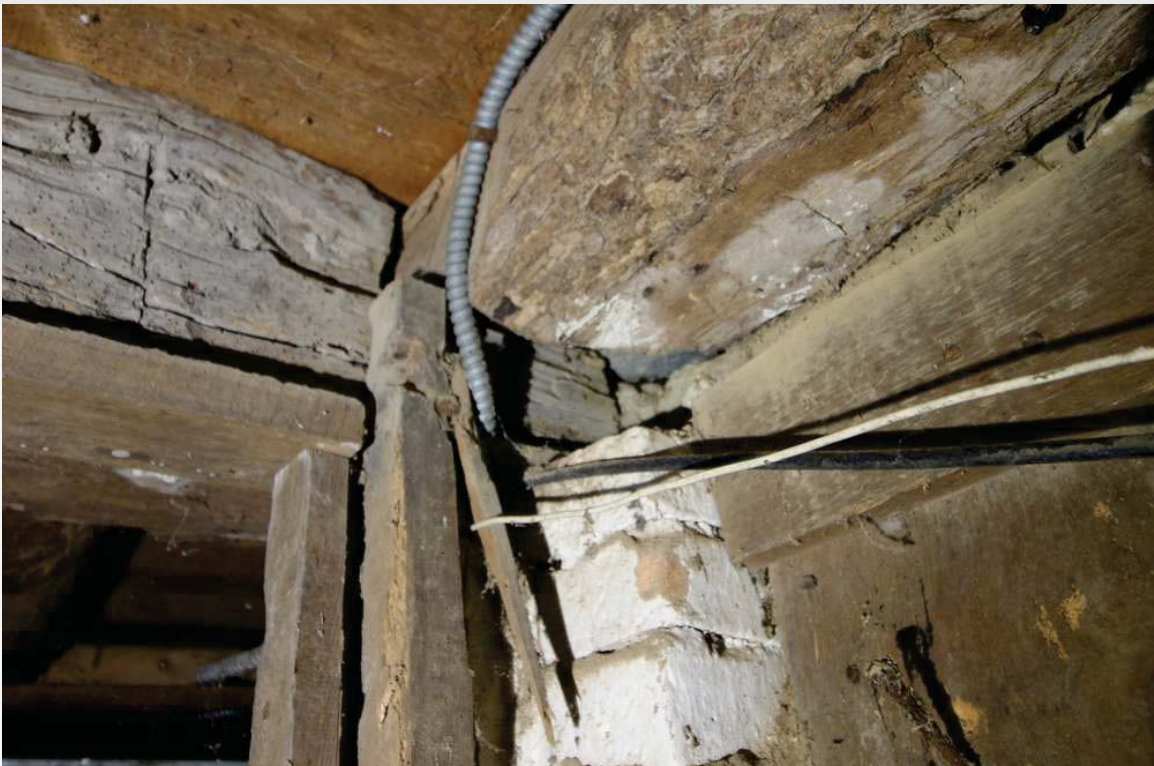
18 156 Piscataqua Rd | Durham, New Hampshire Oct 28, 2019 | 10:06 AM Jessica MilNeil

This exterior sill, resting on the foundation, does not exhibit obvious rot. The level of moisture in the basement and deterioration in exterior framing indicates that sills will nonetheless require extensive repair or full replacement.