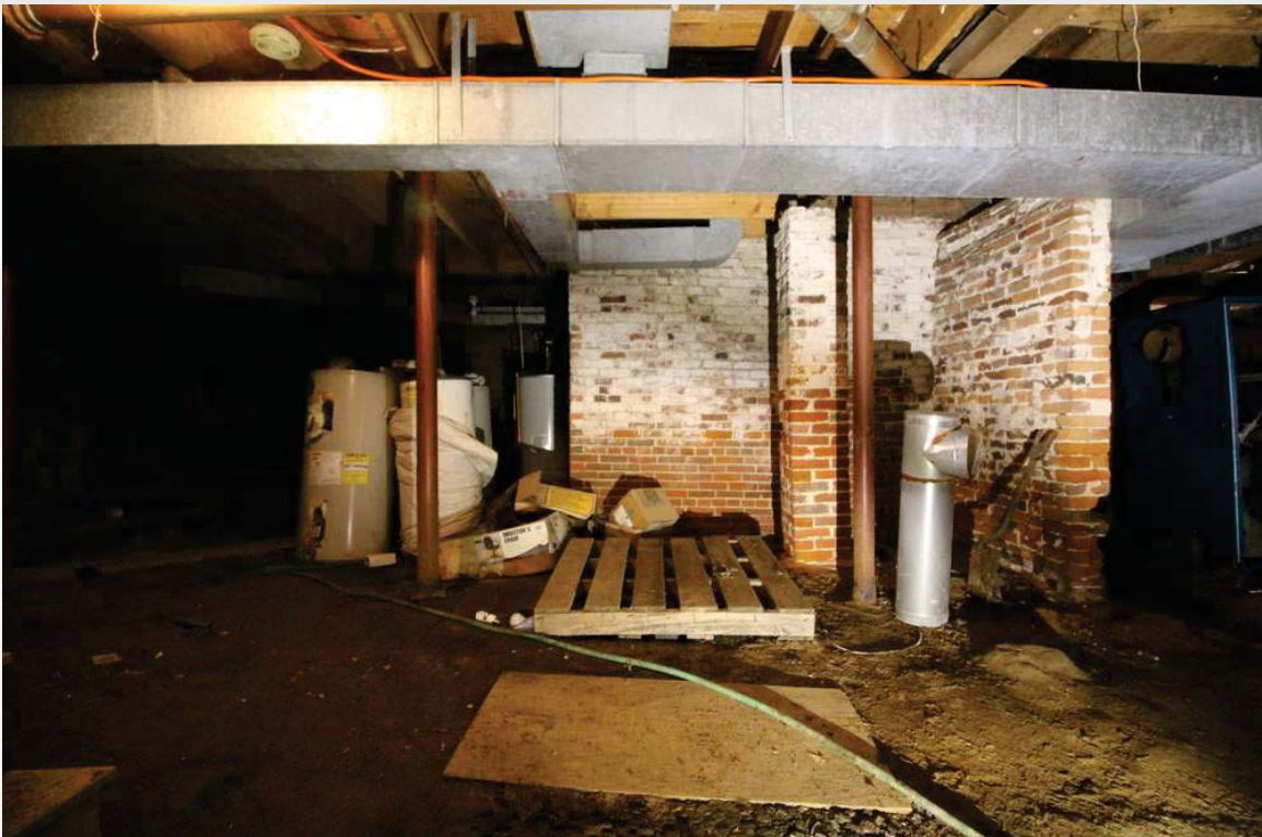
6 156 Piscataqua Rd | Durham, New Hampshire Oct 28, 2019 | 12:37 PM Jessica MilNeil

Basement, standing at south wall, looking north. The basement space contains two large chimney masses and brick partition walls which help support the framing.