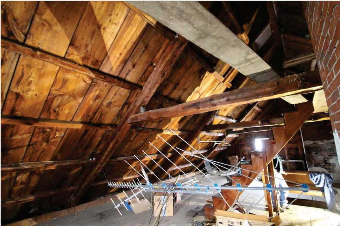
53 | 156 Piscataqua Rd | Durham, New Hampshire | Oct 28, 2019 | 2:07 PM | Jessica MilNeil

The current roof is called a principal rafter-common purlin roof. The rafters are large timbers, tapering from heel to apex of roof. Each pair is connected by a collar tie at the mid-span and bridle joint at the ridge.