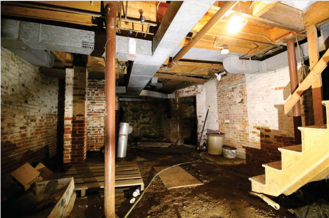
5 156 Piscataqua Rd | Durham, New Hampshire Oct 28, 2019 | 12:36 PM Jessica MilNeil

Basement, standing at south wall, looking north. The basement space contains two large chimney masses and brick partition walls which help support the framing.