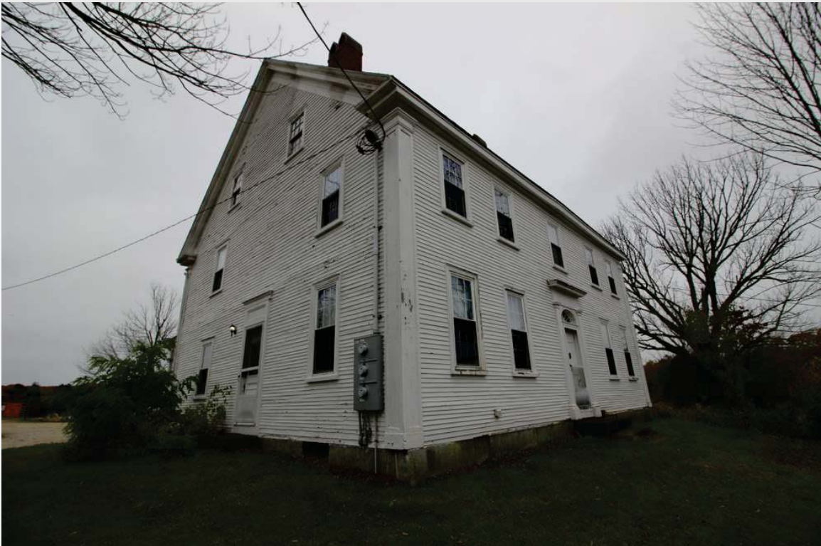
59 156 Piscataqua Rd | Durham, New Hampshire Oct 28, 2019 | 8:55 AM

The exterior contains both Federal and Greek influences. The front entrance, with a fan light is more Federal. The bordered cornerboards and broad elliptical cornice is fairly Greek. It was common for these two styles to interact in a vernacular farmhouse.