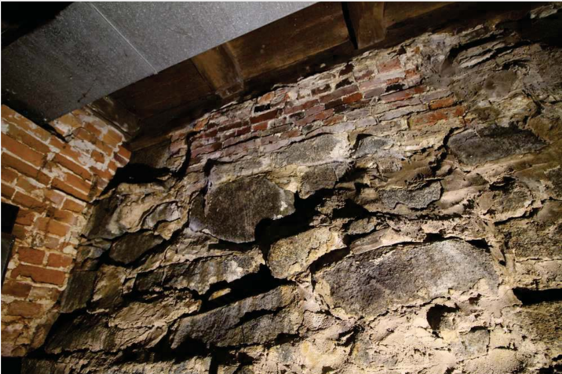
17 156 Piscataqua Rd | Durham, New Hampshire Oct 28, 2019 | 9:42 AM Jessica MilNeil

This exterior sill, resting on the foundation, does not exhibit obvious rot. The level of moisture in the basement and deterioration in exterior framing indicates that sills will nonetheless require extensive repair or full replacement.