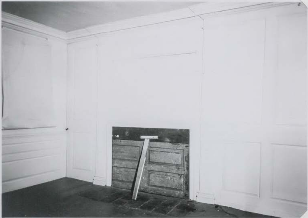
Durham Gen. Sullivan House HABS No NH 1