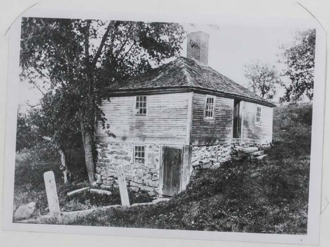
Durham Gen. Sullivan House HABS No NH 1