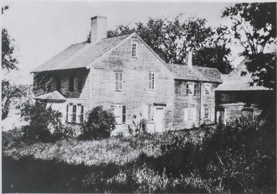
Durham Gen. Sullivan House HABS No. NH 1