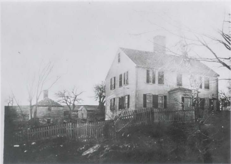
Durham Gen. Sullivan HOUSE HABS No NH 1