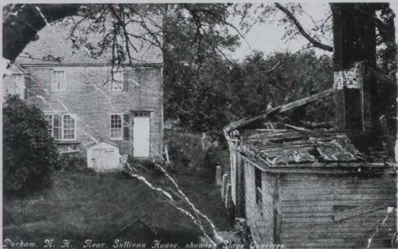
Durham, N. C. Rear, Sullivan House, showing Slave Quarters.

Durham Gen. Sullivan House HABS No. NH 1