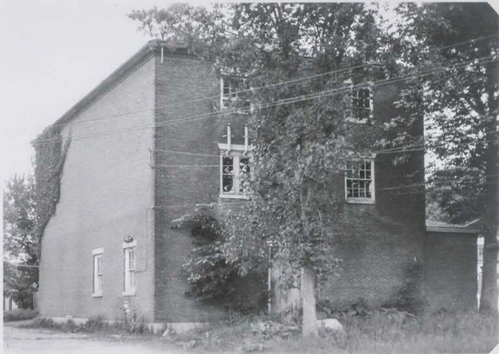
Durham Town Hall HABS No NH 6