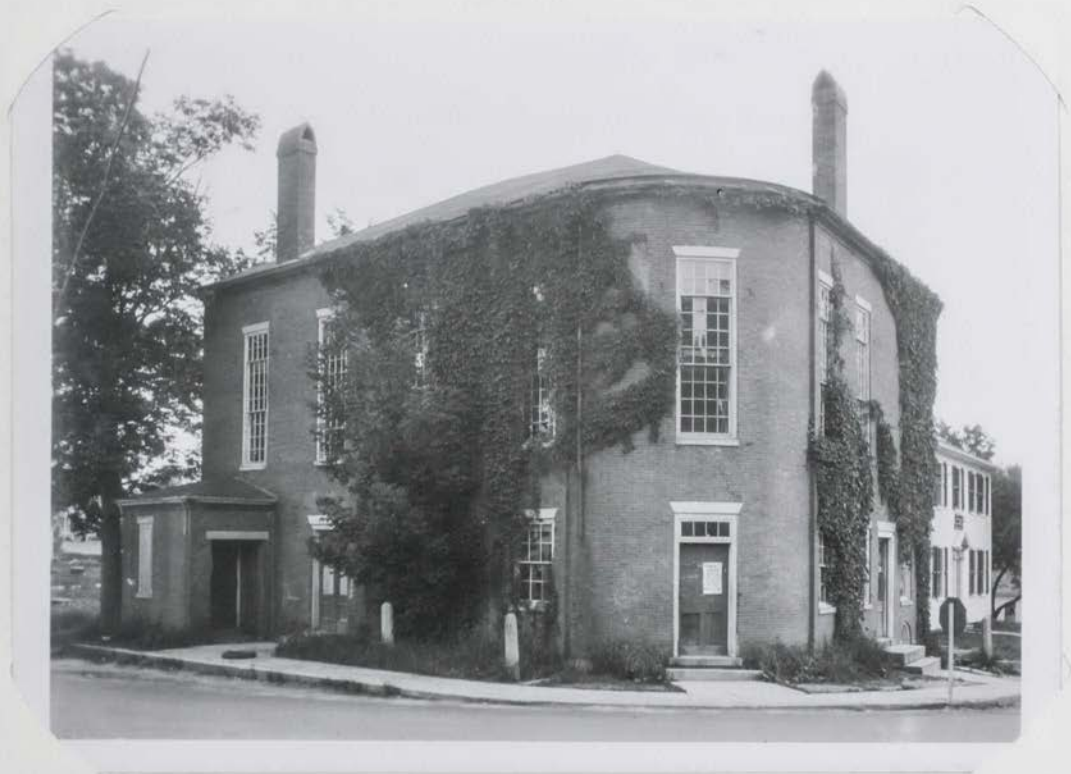
Durham Town Hall HABS No NH 6