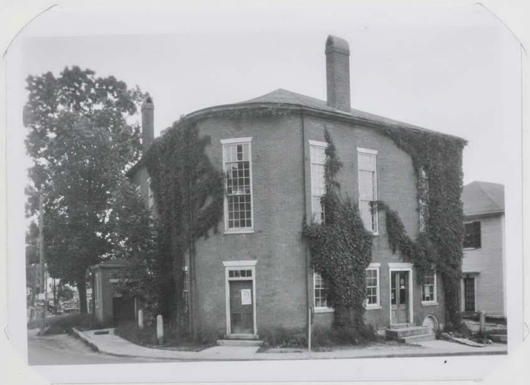
Durham Town Hall HABS No. DH 6