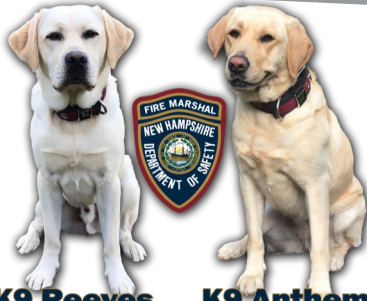
K9 Reeves K9 Anthem