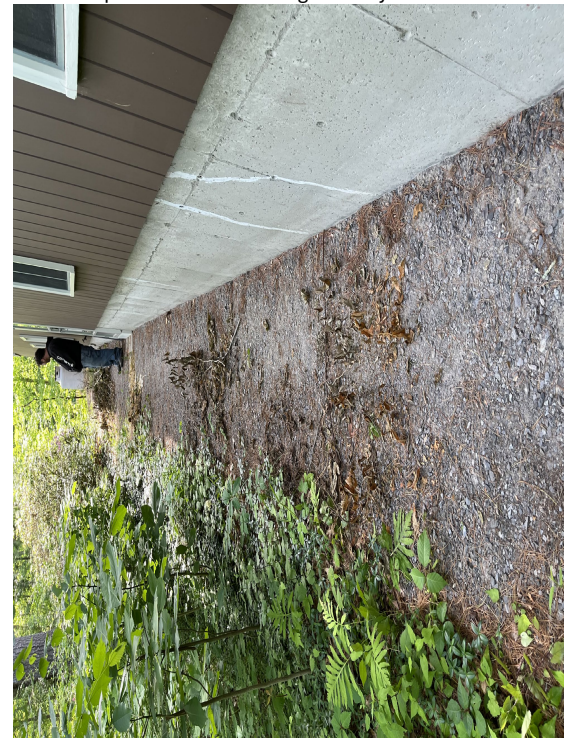
View toward the river from the gravel strip. You can see a small patch of the river near the top. The vegetation is pretty dense with ground cover, shrubbery and trees, and some invasive species.