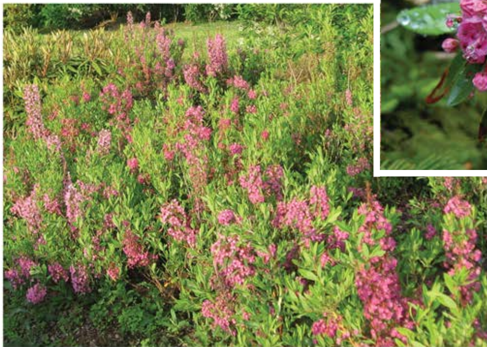
Kalmia angustifolia Family: Ericaceae (Heath) Sheep Laurel, Lambkill, Pig Laurel

Type: Shrub Hardiness range: 5A - 6A Height: 24" to 36" / 60cm to 90cm Spread: 4' to 6' / 1.20m to 1.80m Growth rate: Slow Exposure: Full shade to full sun Persistence: Evergreen Form: Rounded, spreading or horizontal