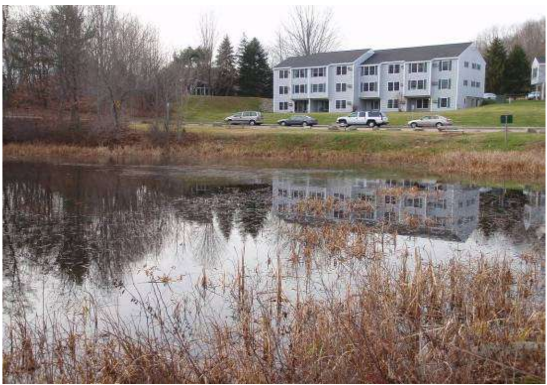
Photo 2: View southwest from small plateau to the western banks of Mill Pond. Woolgrass, broad-leaf cattail, and purple loosestrife are dominant throughout this area.