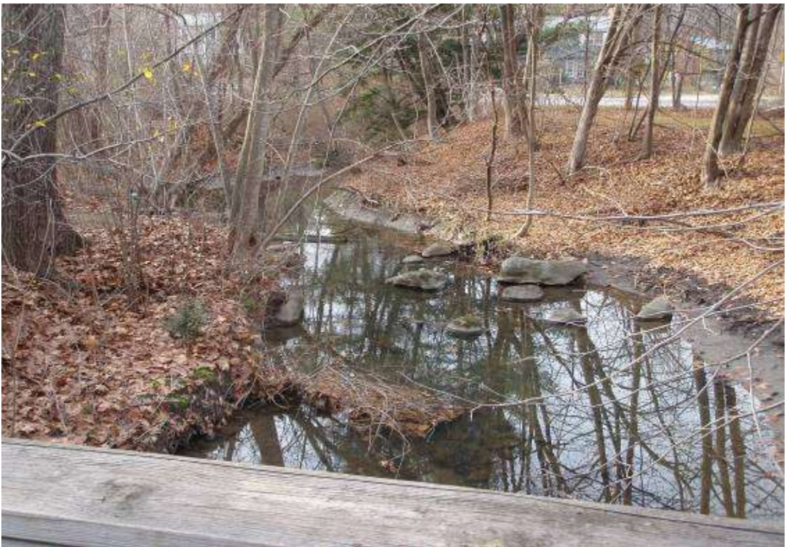
Photo 5: View west towards College Brook which flows into Oyster River just before it reaches Mill Pond.