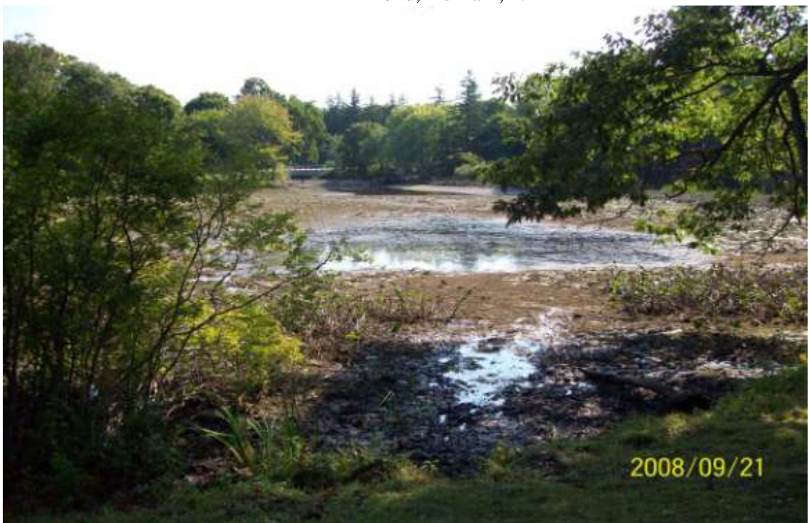
Photo 5 – View looking east from upland peninsula near the middle of the pond.

Appendix A Sept 2008 - Drawdown Photos Mill Pond, Durham, NH