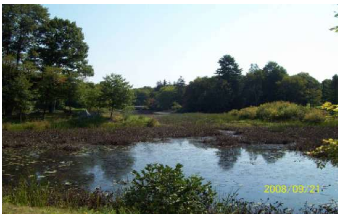
Photo 2 – View of Pond from Mill Pond Road showing a mix of vegetation and standing water.