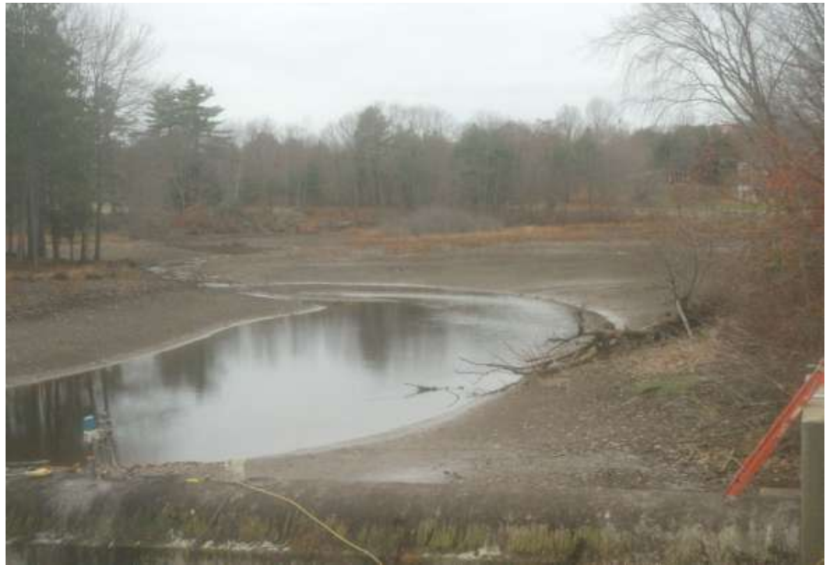
Photo 1 - \text{View of channel just upstream of dam. Photo taken on <math>11/23/2009 .

Appendix A Nov 2009 - Drawdown Photos Mill Pond, Durham, NH