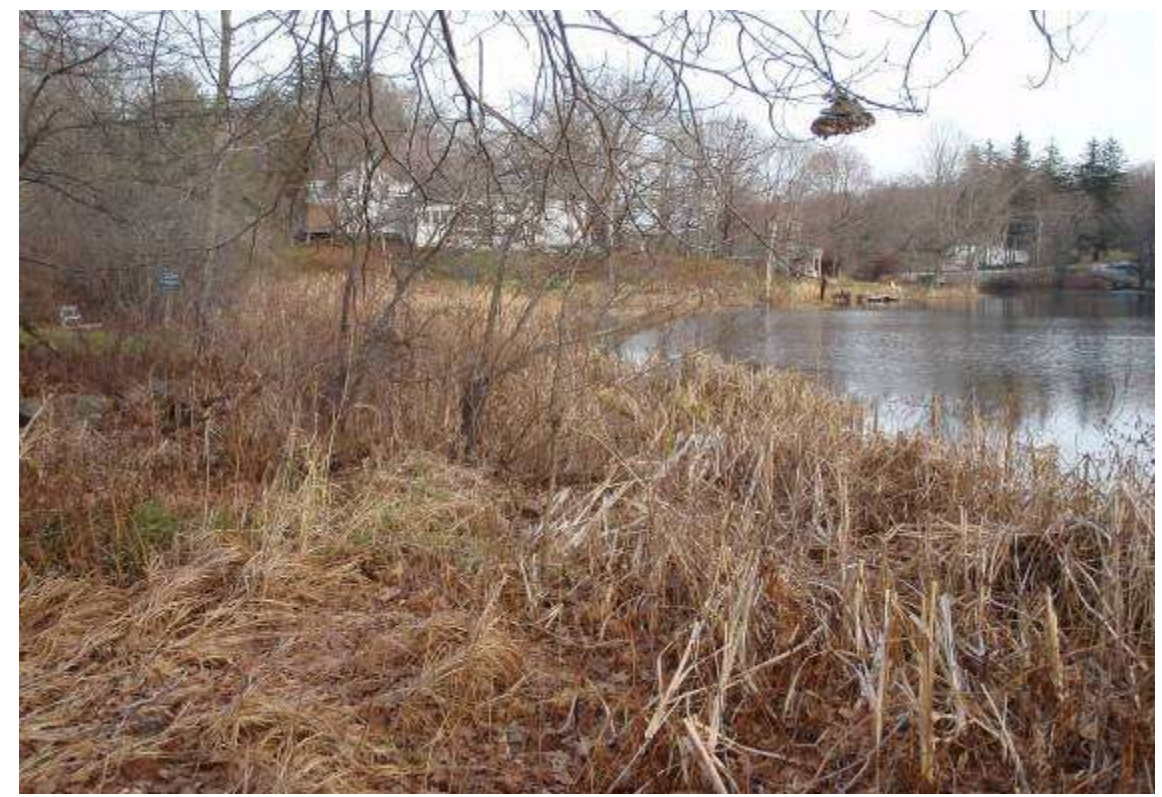
Photo 6: Emergent marsh areas along the northern portions of Mill Pond's western banks.

Photo 5: View west towards College Brook which flows into Oyster River just before it reaches Mill Pond.