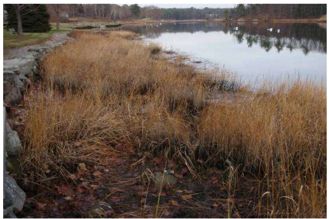
Photo 10: View east at native plant species including saltmeadow cordgrass, prairie cordgrass, blackgrass, and saltmarsh bulrush.