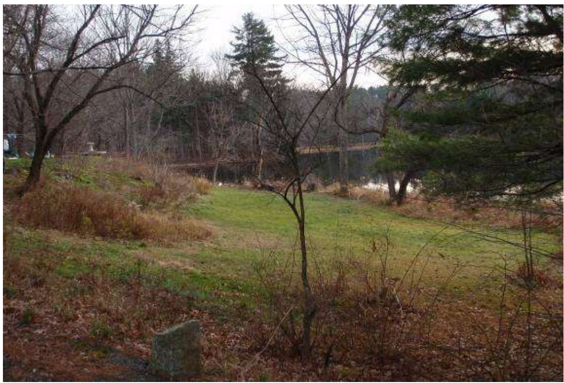
Photo 7: Large residential lawn extending to the edge of the pond on its western side.