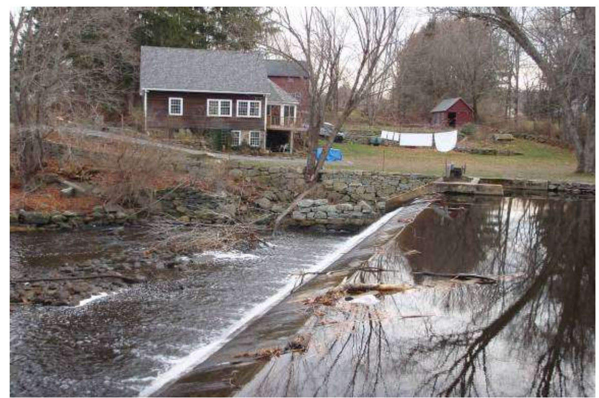
Photo 8: View south towards the existing Oyster River Dam. Stone rip-rap lines the banks surrounding the dam.