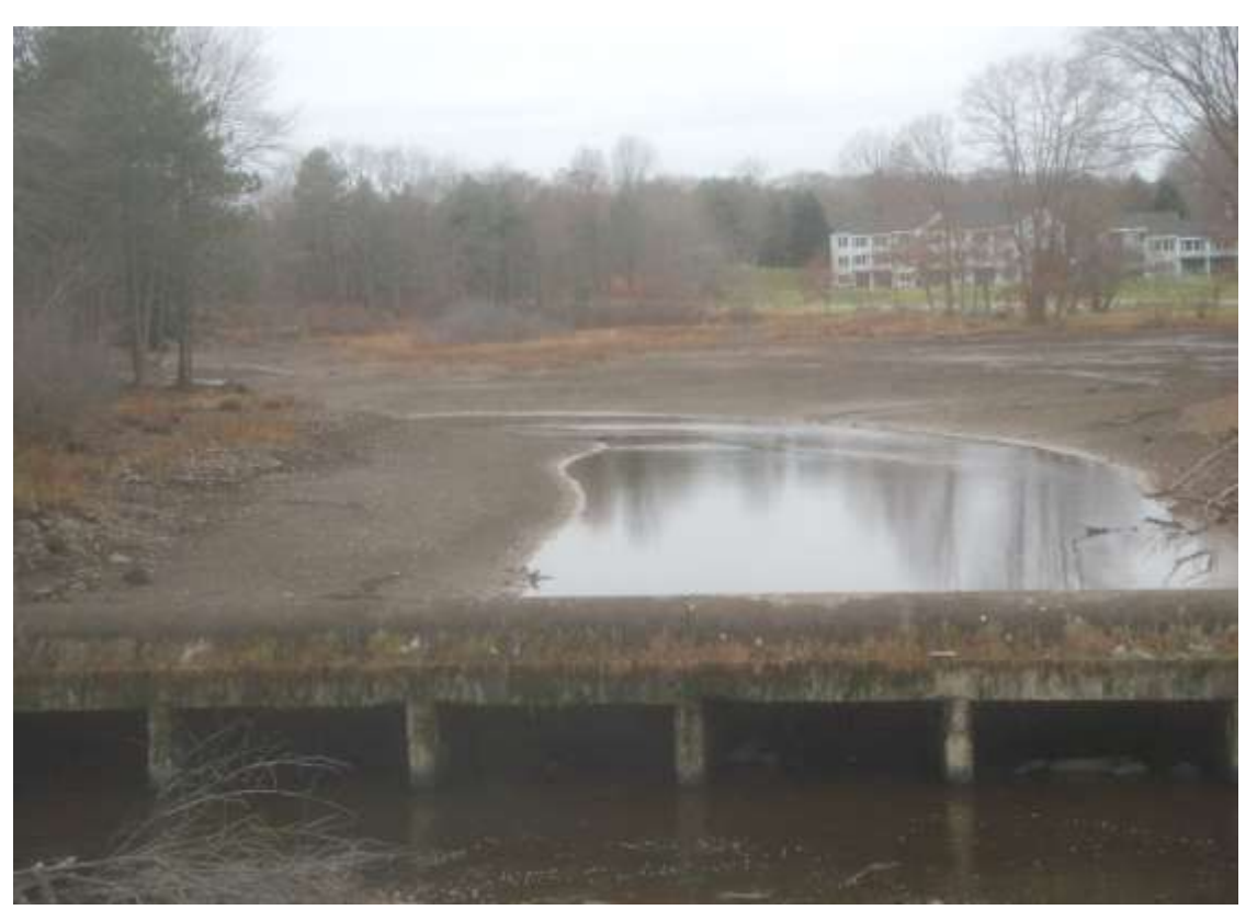
Photo 4 – View from Rte 108 Bridge looking towards Mill Pond Road and dewatered Pond. Photo taken on 11/23/09.