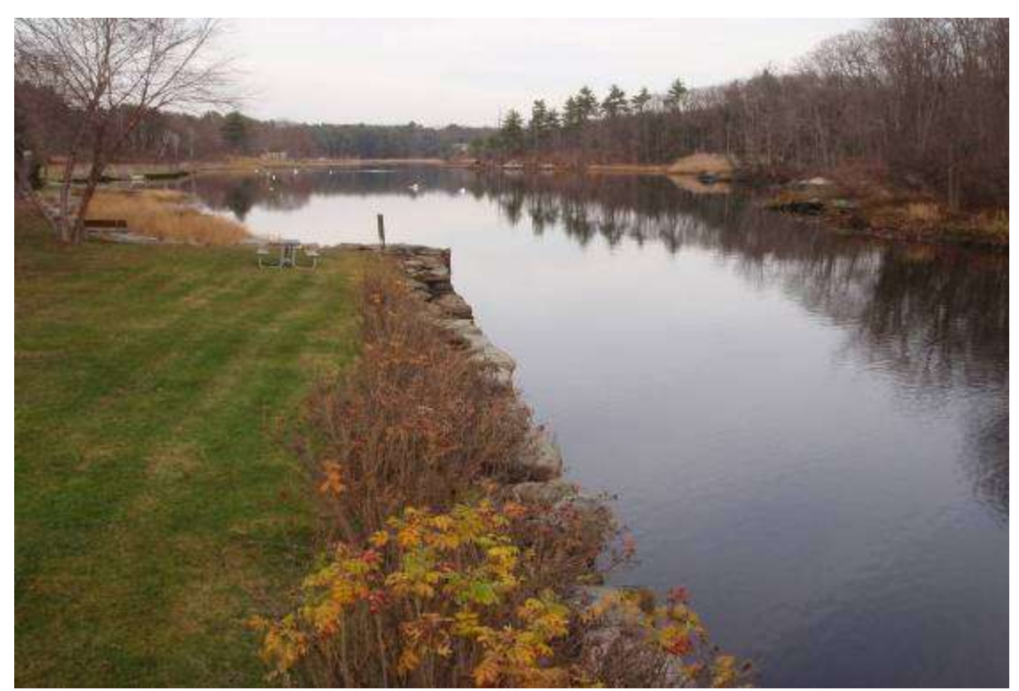
Photo 9: View east towards the banks of the Oyster River downstream of Mill Pond and the Oyster River Dam.