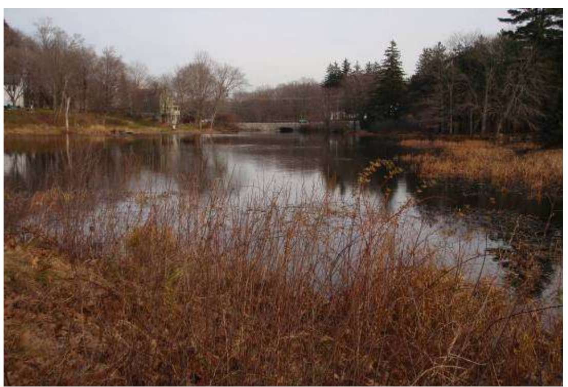
Photo 1: Multiflora rose and other invasives on bank of small plateau reaching out towards the center of Pond from the western side. Oyster River Dam in the background (to the northeast).