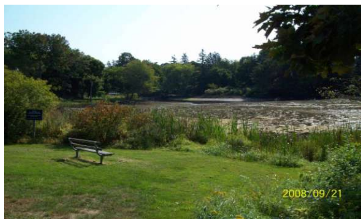
Photo 4 – View from Mill Pond Road with river channel in the background.