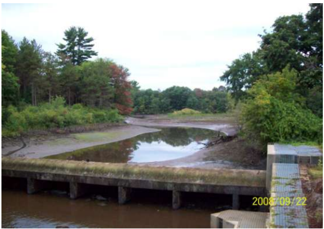
Photo 1 – View of river channel during September 2008 drawdown upstream of a dam.

Appendix A Sept 2008 - Drawdown Photos Mill Pond, Durham, NH