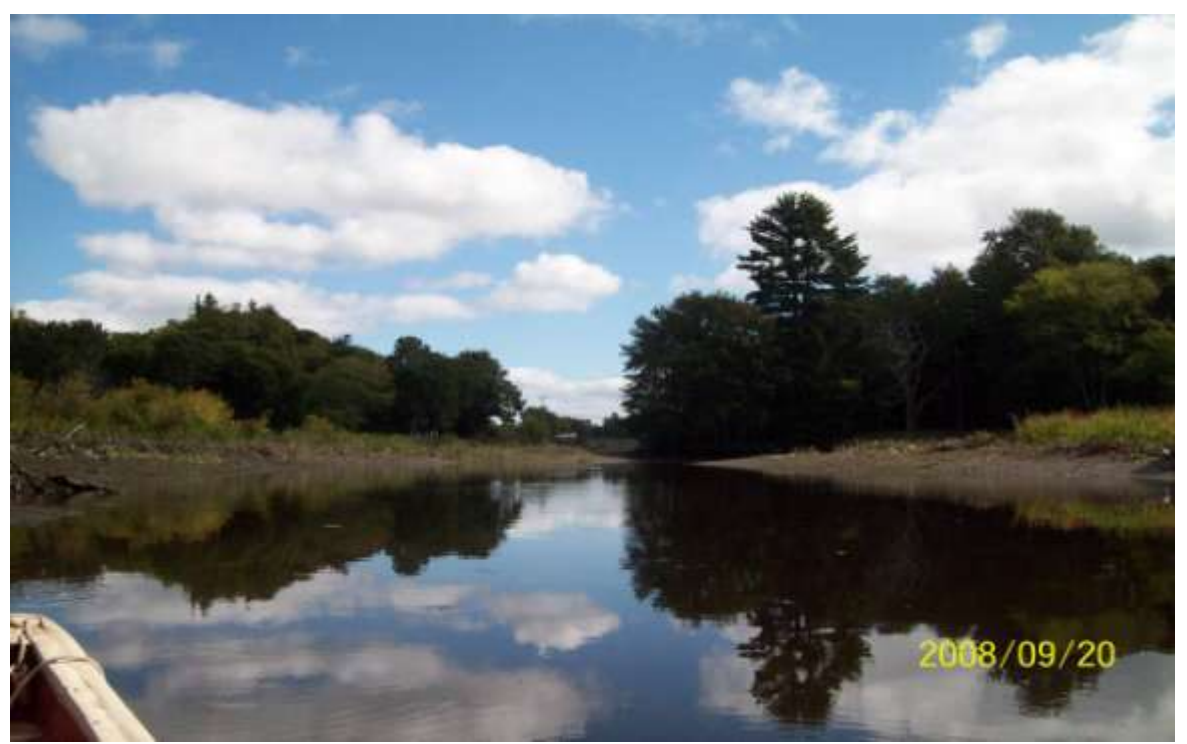
Photo 6 – View of river channel looking east towards dam showing exposed banks during the middle of drawdown period.