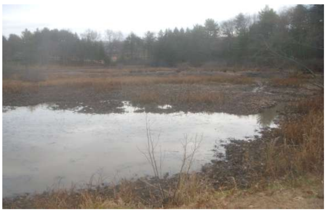
Photo 3 – View looking southwest toward inlet of pond – Photo taken 11/23/2009.

Appendix A Nov 2009 - Drawdown Photos Mill Pond, Durham, NH