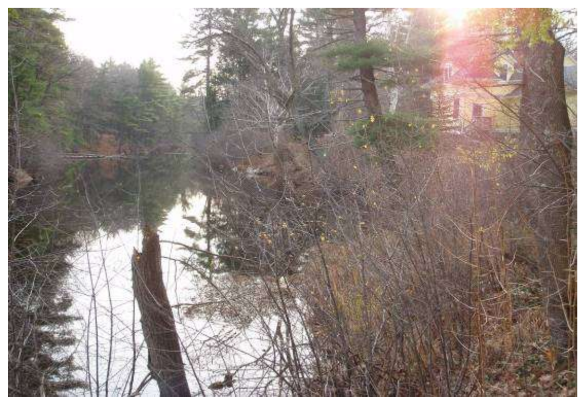
Photo 4: View south along the western banks of the Oyster River just before it flows into Mill Pond. Banks along this portion are steeply sloped with mainly eastern white pine and northern red oak.

Photo 3: View south to a mixture of invasive and native emergent vegetation along the western banks of Mill Pond.