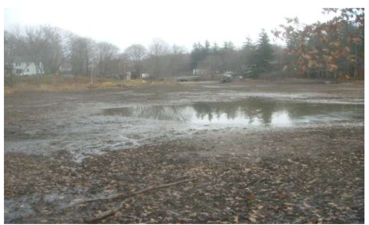
Photo 2 - \text{View of from Mill Pond Road looking towards dam. Photo taken on <math>11/23/09 .