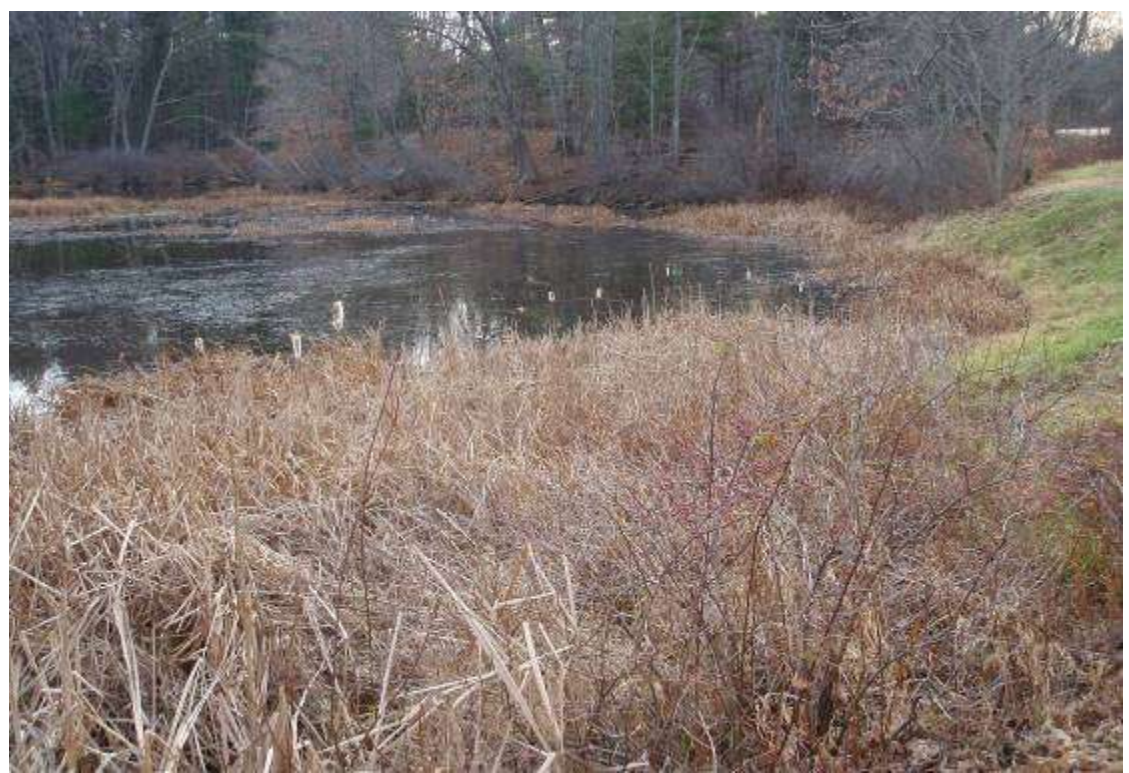
Photo 3: View south to a mixture of invasive and native emergent vegetation along the western banks of Mill Pond.